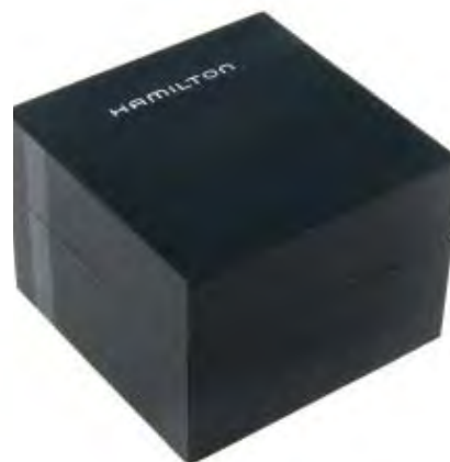
HAMILTON - an incomplete watch box. £40-60