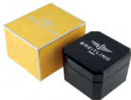
BREITLING - a small group of three complete watch boxes. £60-90