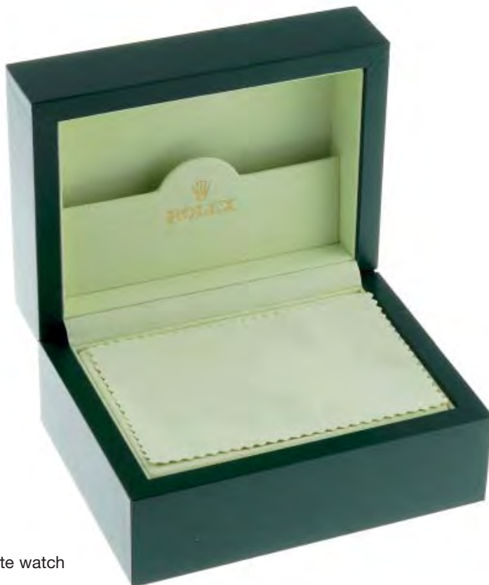
ROLEX - a complete watch box. £80-120