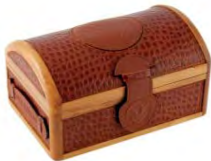
FRANCK MULLER - a complete watch box. £60-90