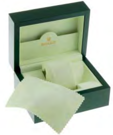
ROLEX - a complete watch box. £80-120