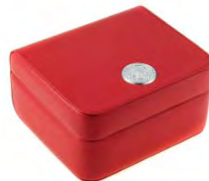
OMEGA - a complete watch box. £50-80