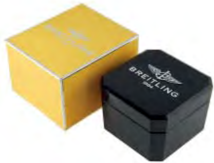
BREITLING - a small group of three complete watch boxes. £60-90