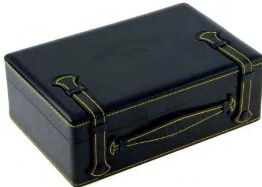
FRANCK MULLER - a complete Casablanca watch box. £60-90