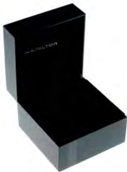
HAMILTON - a complete watch box. £30-50