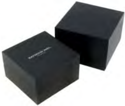
RAYMOND WEIL - a complete watch box. £30-50