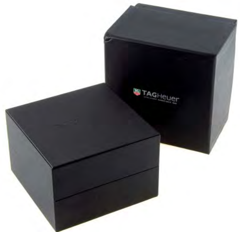
TAG HEUER - a complete watch box. £40-60