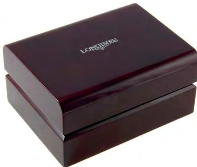
LONGINES - a complete watch box. £40-60