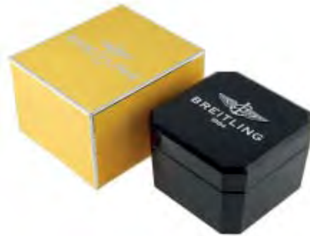
BREITLING - a small group of three complete watch boxes. £60-90