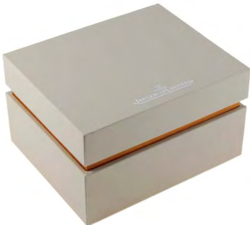
JAEGER-LECOULTRE - a complete watch box. £100-150