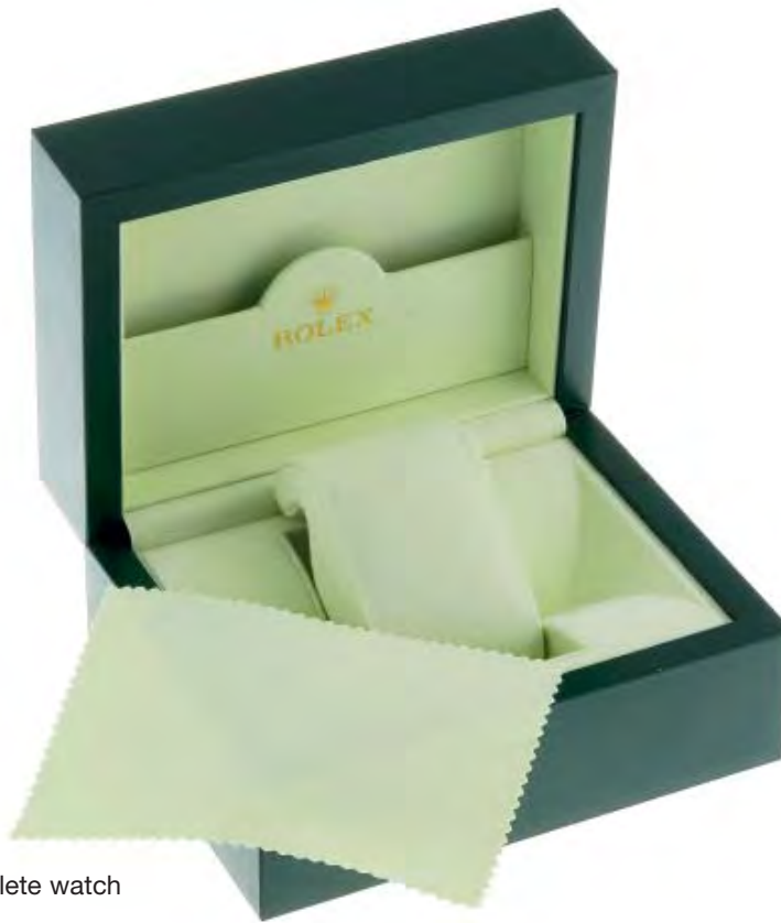
ROLEX - a complete watch box. £80-120