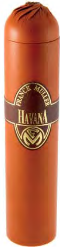
FRANCK MULLER - a complete Havana watch box. £60-90