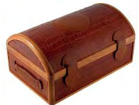
FRANCK MULLER - a complete King Conquistador Cortez watch box. £70-100