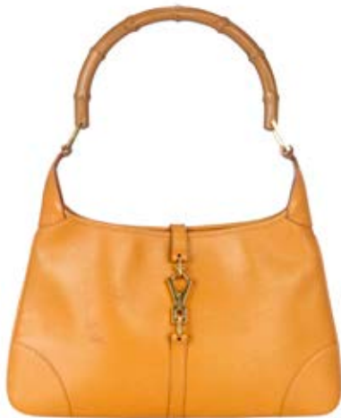
GUCCI - a tan leather shoulder bag. Crafted from textured tan leather, featuring an imitation bamboo top handle and gold-tone hardware with front clip fastening. Measuring 21.5 by 33.5cms. With maker's care card. £90-140