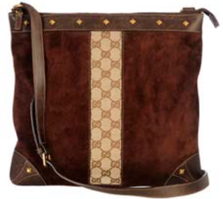
GUCCI - a messenger bag. Designed with a brown suede exterior, central GG monogram striped panel, smooth brown leather trim with stud embellishments, long adjustable crossbody strap and top zip fastening. Measuring 30 by 32cms. £70-100