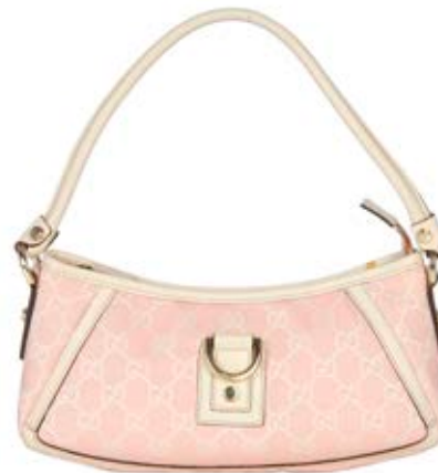
GUCCI - an Abbey GG canvas shoulder bag. The pink GG canvas with cream leather trim and brass hardware. Measuring 13.5 by 26.5cms. With maker's dust bag. £100-150