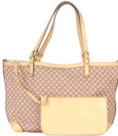
GUCCI - a Craft Diamante canvas tote bag. The beige canvas with purple diamante pattern, with cream leather trim, handles and removable inner leather pouch. Measuring 25 by 47cms. With maker's dust bag. £240-340