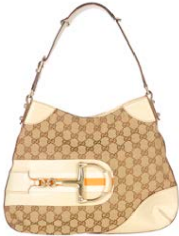
GUCCI - a Hasler bag. The beige GG canvas with cream leather overlay and horsebit detail, cream leather strap and trim and brown fabric lining with inner pocket. Measuring 25 by 34cms. £150-200