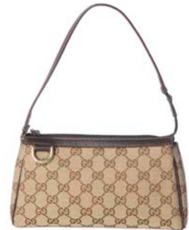
GUCCI - an accessory pouch. Designed with maker's classic GG canvas exterior and textured brown leather trim, engraved exterior D-ring to one top side, single leather handle and top zip fastening. Measuring 5 by 13 by 23cms. £50-80