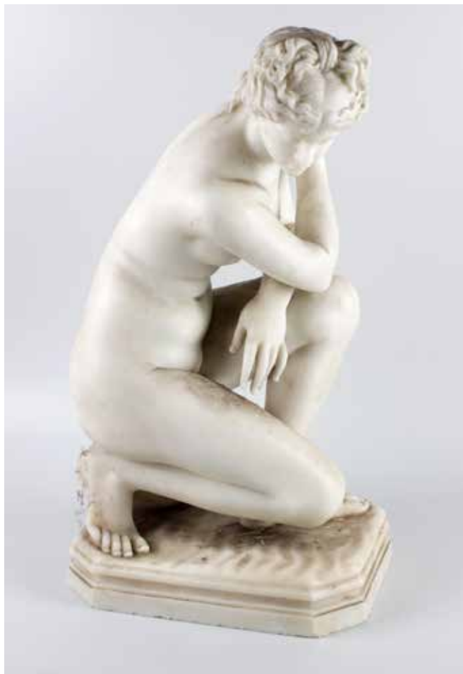
A good late 19th century carved white Carrara marble figure of the Crouching Venus. Modelled seated upon an urn and ripple-moulded canted oblong base, incised signature to edge 'G. Sanguinetti', 24", (61cm) high (s/d). £1,000-1,500 (plus 27.6% BP*)