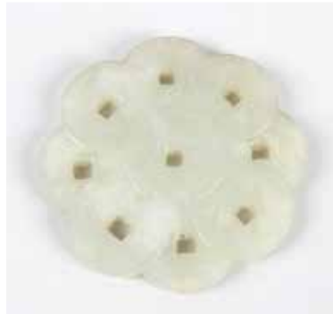
A Chinese carved jade (jadeite) bi disc. Modelled as an arrangement of nine conjoined pierced coins in flowerhead formation, each incised with Chinese characters, 2.2", (5.5cm) diameter. £300-500 (plus 27.6% BP*)