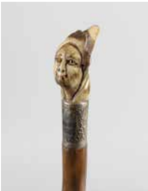
A 19th century walking cane, the carved horn handle modelled as an elderly lady wearing a bonnet, with inset glass eyes, on banded collar engraved 'W Nuttall', on writhen wrist thornwood cane, 33.5" (85cm) long. £80-100 (plus 27.6% BP*)