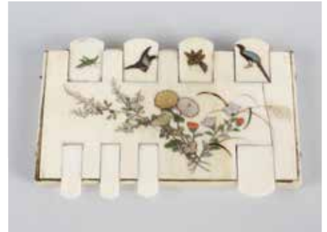
A 19th century Japanese ivory and shibayama whist marker, the inlaid mother of pearl tortoiseshell and coral decoration depicting flowers and insects, 3.75" (9.5cm) long. £80-100 (plus 27.6% BP*)