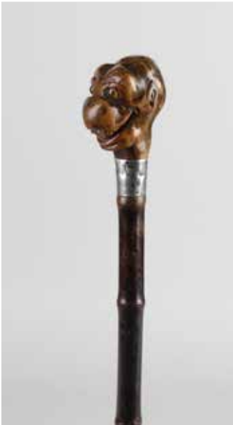
A 19th century walking cane, the carved wooden handle modelled as the head of a monkey with inset glass eyes, on banded white metal collar engraved 'Millie', and dated 1882, and bamboo cane, 36" (91.5cm) long. £80-100 (plus 27.6% BP*)