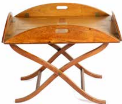
A 19th century butler's mahogany tray and stand. The tray of quartered oval form with hinged flaps centrally pierced with carry handles, 38" x 27" open, (96.5cm x 68.5cm), on a shaped X-frame stand. £120-150 (plus 27.6% BP*)