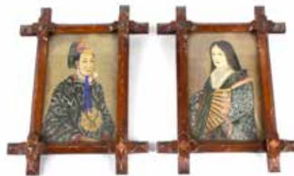
A pair of Japanese Meiji period portraits on silk. Depicting male and female court figures, waist length in three-quarter profile, he with headdress, she with parted hair and holding a fan, each 6.25" x 4", (16cm x 10cm), in period oak Oxford frames, (2). £50-80 (plus 27.6% BP*)