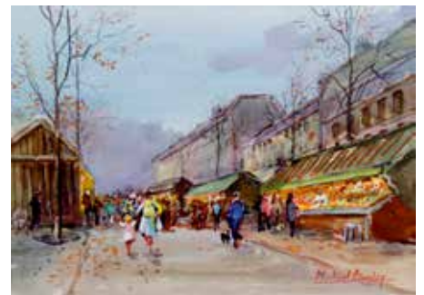
Michael Crawley (Modern), watercolour, Parisian street scene, titled verso 'Flower market Paris', 7" x 9.5" (17.75cm x 24cm), signed. £50-60 (plus 27.6% BP*)