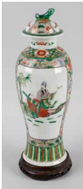
A Chinese porcelain vase and cover, the white glazed ground with hand painted panels depicting figures of elders with carved and pierced hardwood stand, 13" (33cm) high. £100-150 (plus 27.6% BP*)