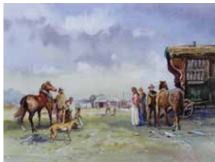
Michael Crawley (Modern), watercolour, 'The country fair', titled verso, 11" x 15" (28cm x 38cm), signed. £60-80 (plus 27.6% BP*)