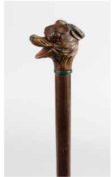
An early 20th century walking cane, the carved wooden handle modelled as the head of a dog with open mouth and inset amber glass eyes, upon a slender simulated rosewood cane, 30.25" (77cm) long. £40-60 (plus 27.6% BP*)