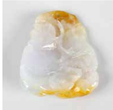
A Chinese carved jade (jadeite) figure of a vegetable. The reverse carved with a large leaf, the whole of pale celadon hue with areas of russet, 2", (5cm) high. £80-120 (plus 27.6% BP*)