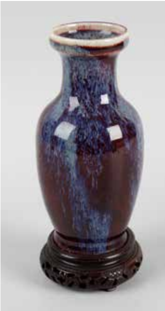
A Chinese pottery vase, of ovoid shaped form decorated in a sang de boeuf high temperature flamb_ glaze, the underside of the base printed with a blue four character mark, with pierced hardwood stand, 6.5" (16.5cm). £70-100 (plus 27.6% BP*)