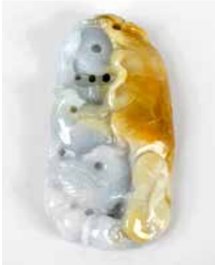
A Chinese carved jade (jadeite) carving of animals and lingzhi. Modelled with a coin and two beasts beside a mushroom and gourd, the whole of pale celadon hue with areas of russet down one side, 2.5", (6.5cm) high. £100-150 (plus 27.6% BP*)