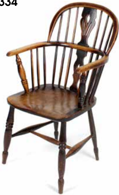
A 19th century ash and elm low hoop back Windsor armchair. With pierced splat between curved arms, the saddle seat on turned legs with H-stretcher, 37", (94cm) high. £100-150 (plus 27.6% BP*)