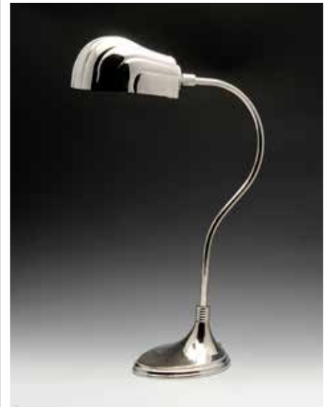
A modern nickel plated desk lamp, the fluted shell shade leading to a curved stem, the whole raised upon an oval stepped base. Maximum height measuring 21 2/8 inches (54 cm). £70-100 (plus 27.6% BP*)