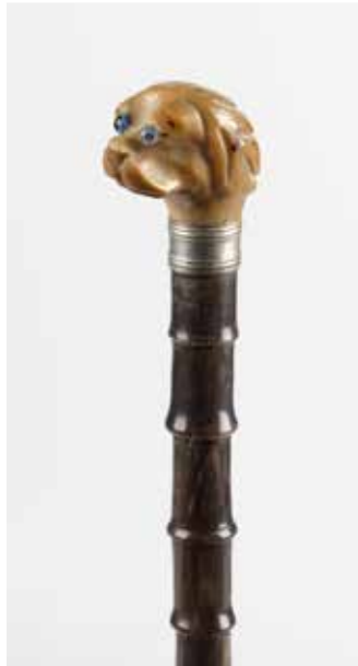
A 19th century walking cane, the carved horn handle modelled as the head of a spaniel with inset blue glass eyes, upon a white metal collar and simulated bamboo cane, 33.25" (84.5cm) long. £60-80 (plus 27.6% BP*)