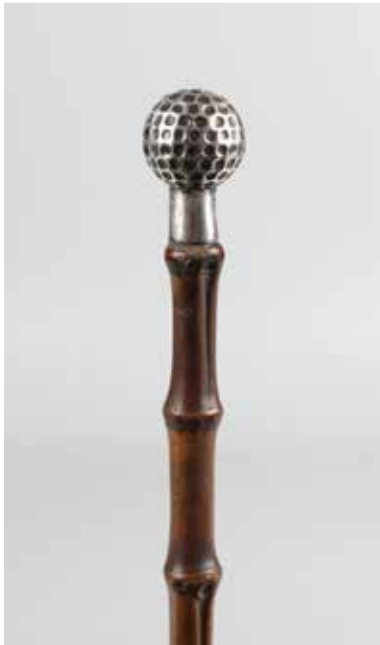
An early 20th century walking cane, the novelty white metal handle modelled as a golf ball, upon collar and bamboo cane, 29" (74cm) long. £50-80 (plus 27.6% BP*)