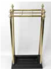
Local interest: A brass and iron six-division stick stand. William Tonks & Son, Birmingham, the rectangular section tubular frame with turned finial over stepped base with drip-tray, having cast stamp beneath, 12" x 7" x 25" high, (30.5cm x 18cm x 63.5cm). £60-90 (plus 27.6% BP*)