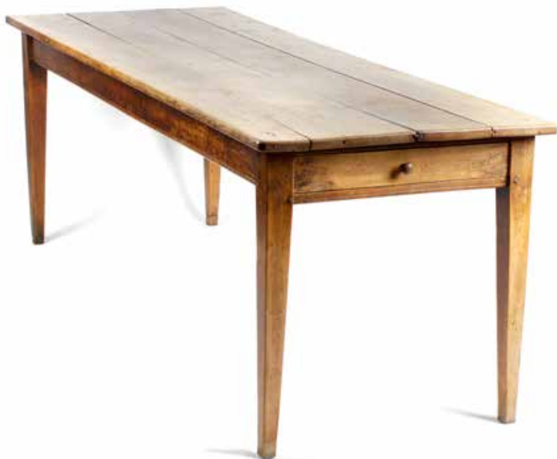
A good early 19th century sycamore farmhouse or 'refectory' table. To seat ten to twelve, the long four-plank top over a pair of short end frieze drawers on four tapering square section legs, 86" x 31" x 30" high, (218.5cm x 78.5cm x 76cm). £600-900 (plus 27.6% BP*)