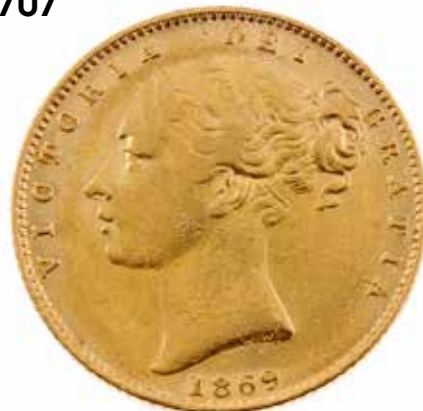
Victoria, Sovereign 1869, rev. shield, die 46. Good very fine. £220-280 (plus 27.6% BP*)