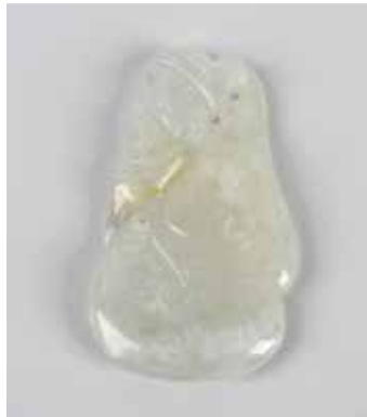
A Chinese carved jade (jadeite) double gourd with bat, the whole of celadon hue with minor russet streaking, 1.8", (4.7cm) high. £80-120 (plus 27.6% BP*)