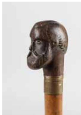
A 19th century walking cane, the carved wooden handle, modelled as the head of a bearded gentleman with inset glass eyes, on gold plated collar, engraved 'C W 3 Queen St Bristol', and malacca cane, 31.75" (80.5cm) long. £60-80 (plus 27.6% BP*)