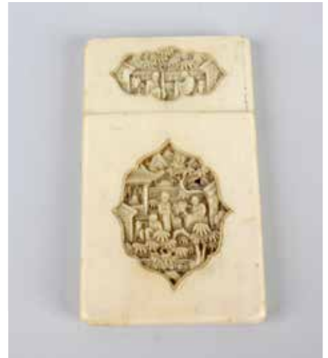
A 19th century Chinese Canton carved ivory card case of oblong form, to one side the body and cover carved with village scenes set in two lobed cartouches, the reverse with central oval panel having carved foliate design, enclosed by border carved with elders amongst blossoming trees, 3.75" x 2.25" (9.5cm x 5.5cm). £120-180 (plus 27.6% BP*)