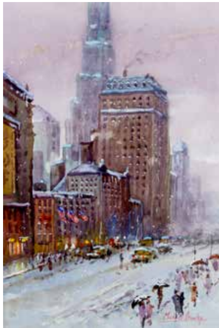
Michael Crawley (Modern), watercolour, view of New York, titled verso 'Winter, Broadway, New York', 11" x 7.5" (28cm x 19cm), signed. £50-80 (plus 27.6% BP*)