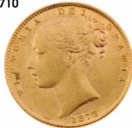
Victoria, Sovereign 1872, rev. shield, die 69. Good very fine. £220-320 (plus 27.6% BP*)