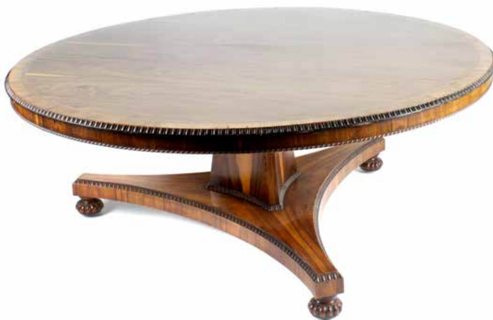
An unusual William VI black walnut veneered and inlaid dining room table, the circular snap top with intricate inlaid border with moulded edge above conforming frieze, the spreading triangular column with moulded band and triform platform base, the carved cup feet with brass castors, diameter of top 71.5" (181.5cm), height 29" (73.75cm). £800-1,200 (plus 27.6% BP*)

BP* - Buyer's Premium of 23% (plus VAT) or 27.6% (VAT included)