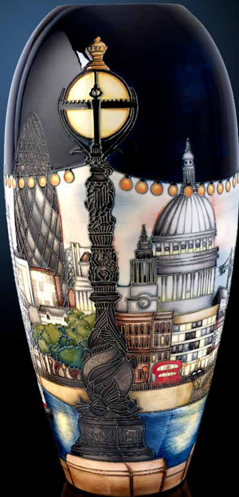
A large modern Moorcroft vase. 'The London', of ovoid form with tube-lined decoration of various city landmarks including St Paul's Cathedral, 30 St Mary Axe ('The Gherkin'), the Millennium Dome, and a Thames-side gas lamp, the vase designed by Paul Hilditch, numbered 51, dated 2011, printed and impressed marks, 18.5", (47cm) high, in card box of issue. £800-1,200 (plus 27.6% BP*)