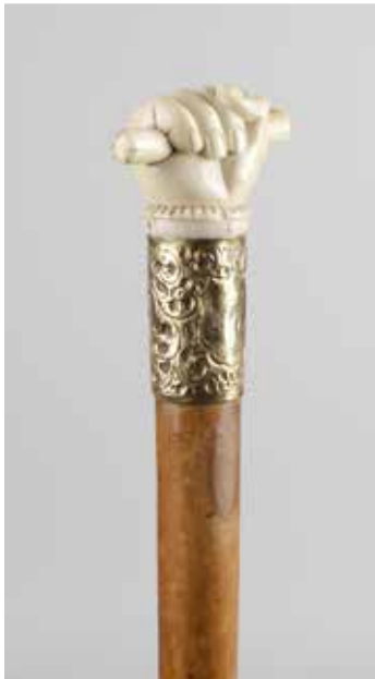
A 19th century walking cane, the carved ivory handle modelled as a hand grasping a scroll, upon embossed gilt metal collar and malacca cane, 36.5" (92.5cm) long. £150-200 (plus 27.6% BP*)