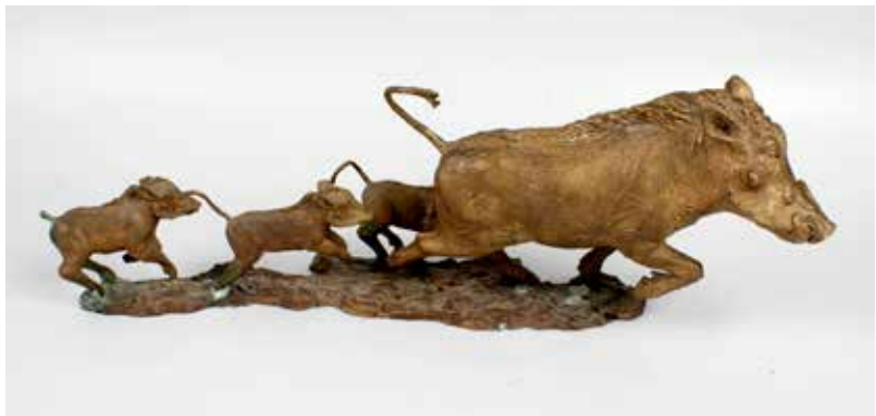
ARR Stephen J. Winterburn, (b. 1954). Family of warthogs, an adult and three young captured in dynamic pose, bronze, signed in the cast to the shaped naturalistic base, 17" long x 5.75" high, (43cm x 14.5cm), (s/d). £300-500 (plus 27.6% BP*)