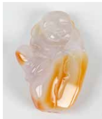
A Chinese carved agate figure of a boy. Of milky hue with russet streaking to lower half, 2.3", (6cm) high. £40-60 (plus 27.6% BP*)