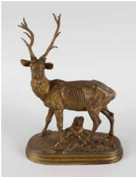
A 19th century bronze animalier study of a stag, standing with head facing to the left, upon an oval shaped base of naturalistic form, indistinctly signed, 9" (23cm) tall. £100-150 (plus 27.6% BP*)