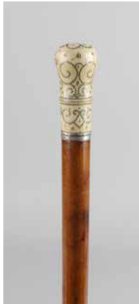
An 18th century gentleman's walking cane, the ivory pique work handle with white metal inlaid decoration, upon white metal collar and malacca cane, 36" (91.5cm) long. £350-450 (plus 27.6% BP*)