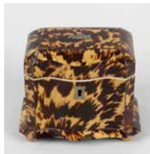
A good early 19th century blonde tortoiseshell tea caddy of small proportions. The canted serpentine-front hinged cover with pewter stringing and a central cartouche, enclosing a single lidded compartment, the conforming body with concave escutcheon over flared apron on bun feet, 5" x 3.5" x 4" high, (12.5cm x 9cm x 10cm). £400-600 (plus 27.6% BP*)