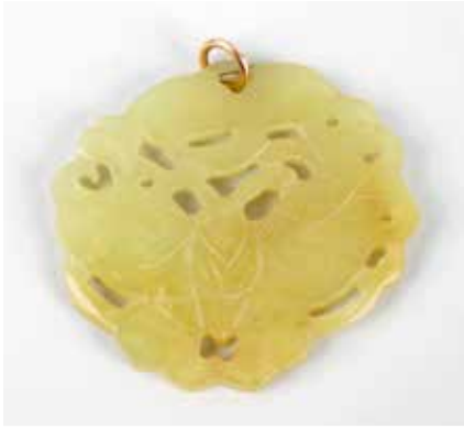
A Chinese carved jade (jadeite) pendant. Of pierced design incised with a butterfly, the whole of yellowish green hue, 2", (5cm) wide. £40-60 (plus 27.6% BP*)