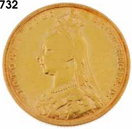
Victoria, Sovereign 1891, jubilee head. Fair. £160-220 (plus 27.6% BP*)