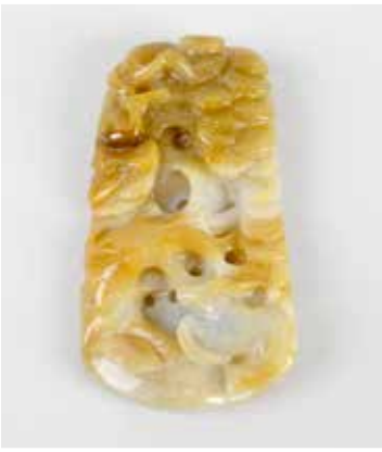
A Chinese carved jade (jadeite) pebble. Modelled with a deer beneath pine tree, the whole of celadon hue with russet borders, the reverse mainly russet, 2.5", (6.5cm) high. £200-300 (plus 27.6% BP*)