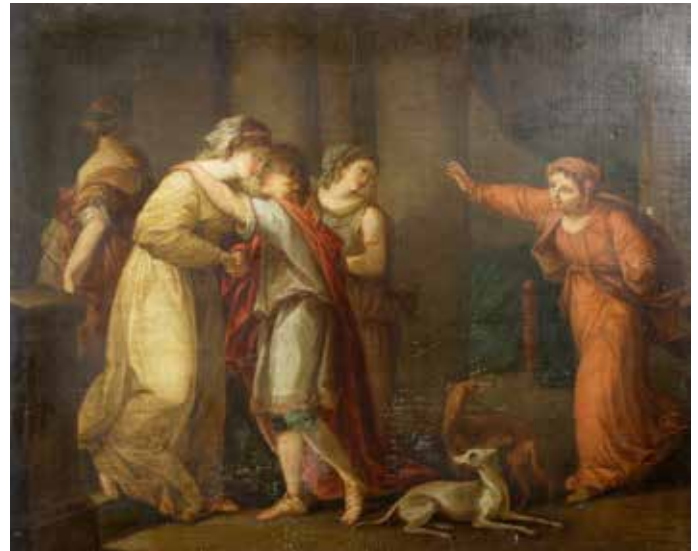
Follower of Angelica Kauffmann (Kauffmann), (1741-1807). 'The Return of Telemachus', figures and dogs in a temple interior, oil on canvas, unsigned, 24.5" x 30.5", (62cm x 77.5cm), in period acanthus-moulded gilt frame under glass.