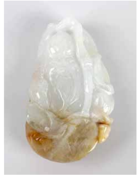
A Chinese carved jade (jadeite) figure of Jurojin. The bearded sage modelled in seated pose holding a staff, the whole of pale celadon hue with areas of russet to base and reverse, pierced as pendant, 2.5", (6.5cm) high. £150-250 (plus 27.6% BP*)