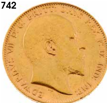
Edward VII, Sovereign 1907P. Very fine. £180-240 (plus 27.6% BP*)