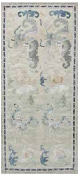
Two Chinese silk sleeve panels. The first worked with bats, butterflies and flowers on a cream ground within a border of shou motifs, 21.5" x 12", (54.5cm x 30.5cm), the second worked with a flowering plant, the petals inset with paste stones, against a dark ground within pink border, 25" x 12.5", (63.5cm x 32cm), both framed under glass, (2). £50-80 (plus 27.6% BP*)