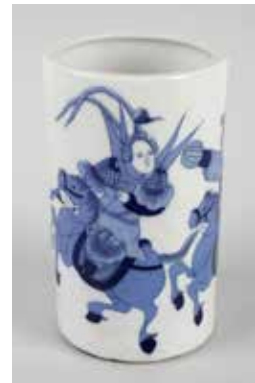
A Chinese porcelain blue and white vase, of cylindrical shaped form, its front decorated with warriors upon horseback, the underside of the base with blue six character mark, 5.25" (13.5cm) high. £100-150 (plus 27.6% BP*)