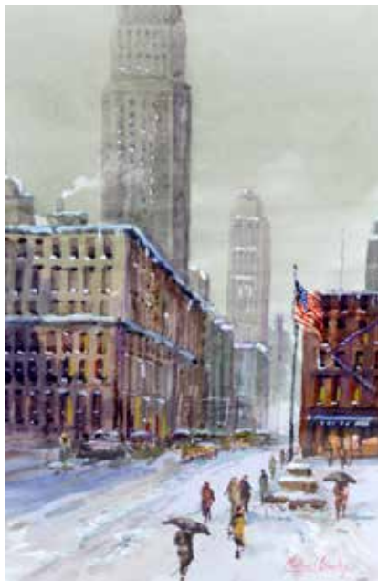
Michael Crawley (Modern), watercolour, View of New York, titled verso, 'Winter Empire State, New York, 12" x 8" (30.5cm x 20.25cm), signed. £50-60 (plus 27.6% BP*)