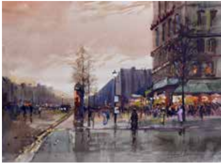
Michael Crawley (Modern), watercolour, Parisian street scene, titled verso 'Boulevard Crepuscule', Paris, 7.75" x 10.5" (19.5cm x 26.75cm). £50-60 (plus 27.6% BP*)