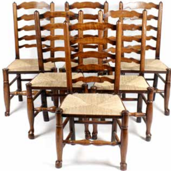
Eight 19th century rush-seated ash ladderback dining chairs. A well-matched harlequin set, each with five shaped rungs between turned uprights, the rush seat on turned club legs to the front, with hoof feet, double spindle front stretcher and plain turned parallel side stretchers, (8). £300-500 (plus 27.6% BP*)