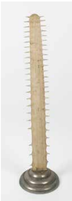
Taxidermy: a sawfish rostrum, on stepped circular metal base, 37.5" (95cm) long, sold with Article 10 CITES permit. £80-120 (plus 27.6% BP*)