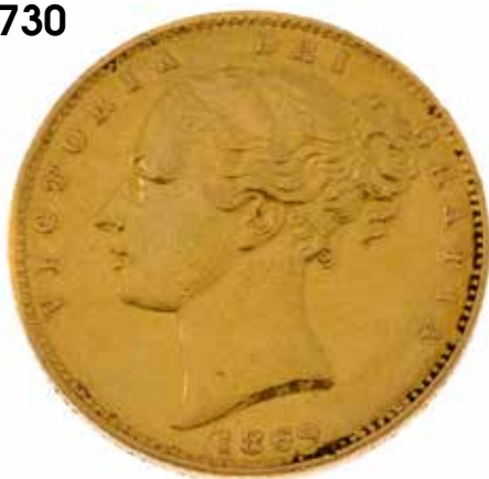
Victoria, Sovereign 1869, young head, rev. shield, die 7. Very fine, previously mounted. £200-300 (plus 27.6% BP*)