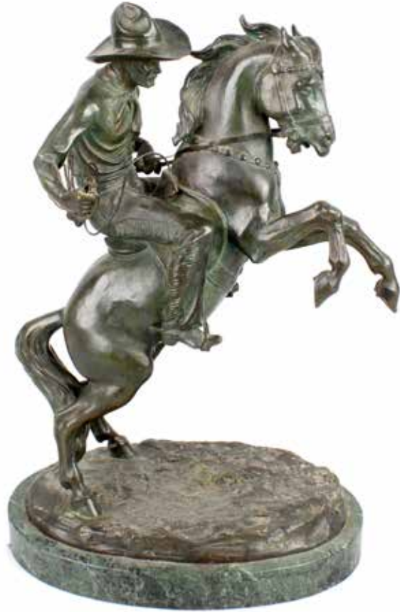
Theodor Ullmann, (fl. early 20th century). A patinated bronze model of a cowboy or bronco rider, holding the reins of a rearing horse, on naturalistic oval base, signed in the cast TH. ULLMANN, on verde antico marble plinth, 16", (40.5cm) high overall. £500-800 (plus 27.6% BP*)