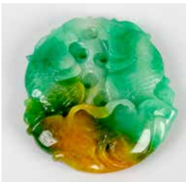
A Chinese carved jade (jadeite) double carp group. The twin fish issuing from a lotus or similar, the whole of mainly emerald hue with areas of celadon to centre and russet to base, 2", (5cm) high. £200-300 (plus 27.6% BP*)