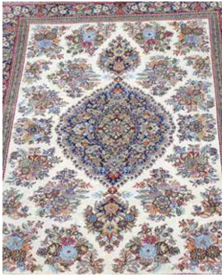
An Eastern wool rug, the cream-coloured field with central polychrome floral medallion and spandrels, within indigo-ground floral border and red outer frame, 114" x 77", (290cm x 195cm). £100-150 (plus 27.6% BP*)