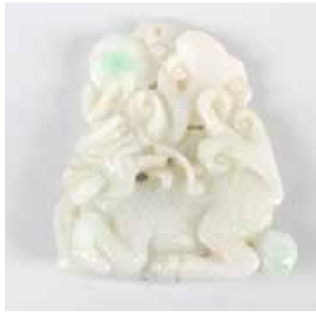
A Chinese carved jade (jadeite) figure of a qilin or kylin. Modelled in recumbent pose looking over its back, a coin to the reverse, the whole of pale celadon hue with isolated areas of emerald green, 2.2", (5.5cm) high. £150-250 (plus 27.6% BP*)