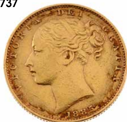
Victoria, Sovereign 1885M, rev. shield. Good fine, ex loose mount. £200-250 (plus 27.6% BP*)