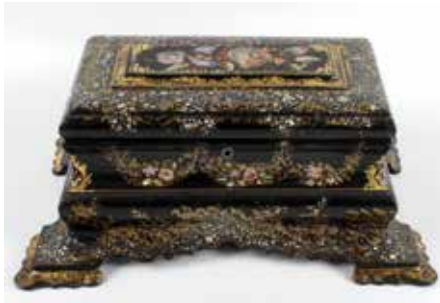
A Victorian papier mache tea caddy, with hand painted and mother of pearl inlaid decoration, the opening hinged cover lifting to reveal a fitted interior with central glass mixing bowl flanked by lidded storage compartments, 16" x 7.25" (40.75cm x 18.5cm). £150-180 (plus 27.6% BP*)