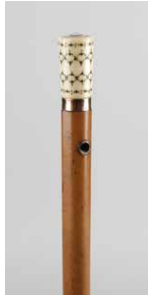
A 19th century gentleman's walking cane, the ivory pique work handle with white and yellow metal inlaid decoration, stone set top and 9ct gold banded collar, upon a slender cane with brass ferrule, 36" (91.5cm) long. £250-300 (plus 27.6% BP*)