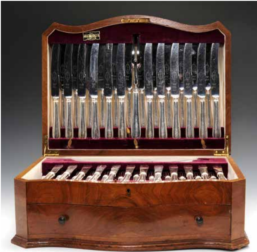
A silver plated King Alfred pattern canteen for twelve place settings comprising dinner knives, dinner forks, fish knives, fish forks, side knives, side forks, dessert spoons, teaspoons (one deficient), carving set and four table spoons, in tiered fitted wooden case. £60-90 (plus 27.6% BP*)