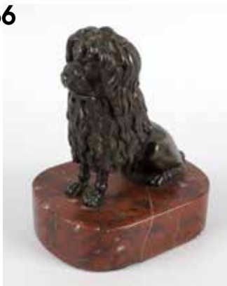
A 19th century novelty bronze inkstand, modelled as a seated spaniel, with hinged head lifting to reveal a fitted glass inkwell, upon an oval shaped rouge marble base, 5.25" (13.5cm) high. £120-160 (plus 27.6% BP*)