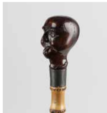
A 19th century walking cane, the carved wooden handle modelled as the head of a grotesque male poking his tongue out, on white metal banded collar and bamboo cane, 35" (89cm) long. £80-120 (plus 27.6% BP*)