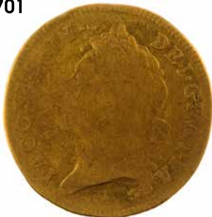
James II, gold Guinea 1685 (S 3400). Fair, portrait flat, reverse better. £200-300 (plus 27.6% BP*)