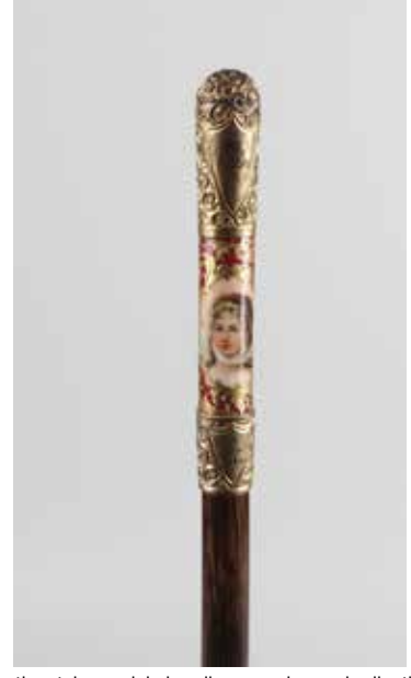
A Continental porcelain handle parasol or umbrella, the cylindrical handle decorated with a portrait panel of a young lady reserved upon a puce coloured ground with gilt scroll work detail, 36" (91.5cm) long. £100-150 (plus 27.6% BP*)