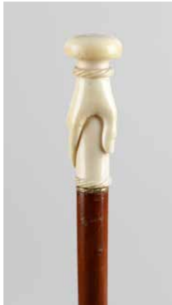
A 19th century walking cane, the carved ivory handle modelled with a grasping hand, on gilt metal collar and malacca cane, 37" (94cm) long. £100-200 (plus 27.6% BP*)