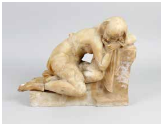
An early 20th century Italian carved alabaster figure of Cleopatra. Eugenio Battaglia, circa 1900, the figure seated and resting upon a pedestal, wearing a headdress and tasselled skirt, incised signature BATTAGLIA verso, the whole of 'mutton fat' colouring, 15" wide x 12.25" high, (38cm x 31cm), (a/f). £250-350 (plus 27.6% BP*)

BP* - Buyer's Premium of 23% (plus VAT) or 27.6% (VAT included)