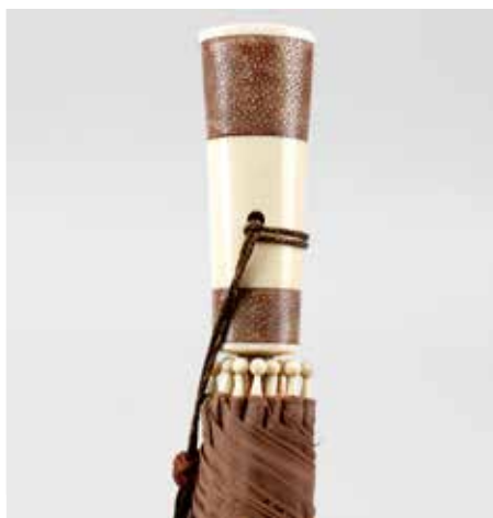
A good quality Japanese ivory-handled parasol or umbrella. Circa 1920s, the broad tapering oval section handle with stained bands of decoration emulating shagreen, and pierced for hanging, to a cane shaft and russet canopy with label 'Renovated by Reid & Todd Glasgow', the ribs with ivory tips, to an ivory ferrule, handle 5", (13cm) long, overall 27", (69cm), together with another marked to ribs 'PARAGON - S. FOX & CO. LIMITED, with ivory tips, later ferrule, handle 4.5", (11.5cm) long, overall 25.75", (65.5cm). £200-300 (plus 27.6% BP*)