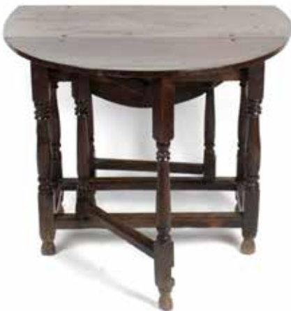
An early 18th century oak gateleg table. The round top with oval flaps over long frieze drawer on spindle-turned legs and matching gateleg, united by moulded stretchers on inverted cup feet, 34.25" x 16" closed / 42" open x 28.5" high, (87cm x 40.5cm / 107cm x 72.5cm). £80-120 (plus 27.6% BP*)