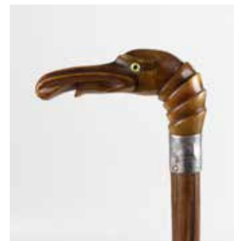
A 19th century walking cane, the carved horn handle modelled as the head of a grotesque bird with inset glass eyes, on hallmarked silver banded collar with engraved initials A P B, and rustic wooden cane, 33.75" (85.75cm) long. £60-100 (plus 27.6% BP*)

BP* - Buyer's Premium of 23% (plus VAT) or 27.6% (VAT included)