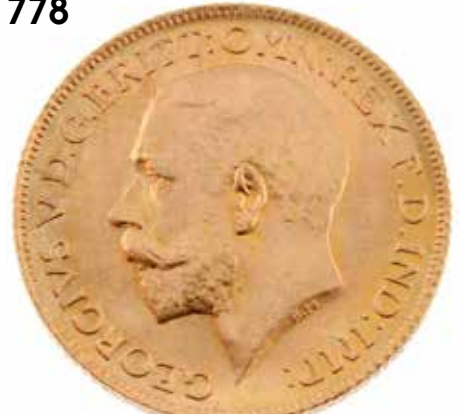
George V, Sovereign 1925. Good very fine. £180-240 (plus 27.6% BP*)

BP* - Buyer's Premium of 23% (plus VAT) or 27.6% (VAT included)