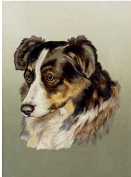
Manner of Bessie Bamber, (early 20th century). A head study of a collie dog, depicted in three-quarter portrait profile facing right, oil on artist's board, unsigned, 11.5" x 8.5", (29cm x 21.5cm), in gilt slip and foliate scroll-moulded gilt frame. £50-80 (plus 27.6% BP*)