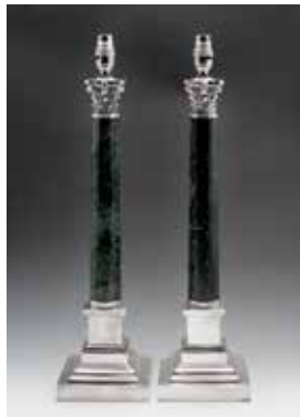
A pair of modern silver plated table lamp bases, each with an acanthus leaf moulded capital above a tapered green marble Corinthian column, upon a stepped plinth base. Maximum height measures 23 inches (58.5 cm). £200-300 (plus 27.6% BP*)