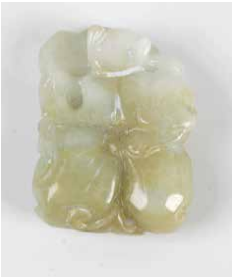
A Chinese carved jade (nephrite or dark jadeite) figure of a qilin or kylin. Modelled in standing pose beside lingzhi over two vegetables or fruit, the whole of celadon and olive green hue, 1.3", (3.4cm) high. £50-80 (plus 27.6% BP*)