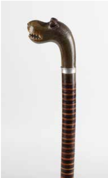
A 19th century walking cane, the carved horn handle modelled as a hippopotamus, the open mouth inset with bone teeth, the cane formed from layered circular discs of alternating woods, 36" (91.5cm) long. £120-160 (plus 27.6% BP*)