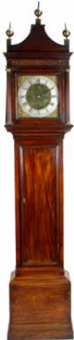
A George III mahogany-cased 8-day dial brass longcase clock with five-pillar movement. (Thomas) Moore of Ipswich, circa 1780, the 12-inch square dial having a silvered chapter ring with Roman hours and Arabic minutes framing subsidiary date and calendar dials, signed 'Moore Ipswich' in cursive script, within rococo foliate scroll spandrels, the knopped five-pillar movement rack-striking on a bell, the case with three brass ball-and-spire finials to a pagoda top and blind fretwork frieze over reeded columns with brass capitals, the long trunk door with moulded frame, the plain base on stepped plinth, 94", (239cm) high. £400-600 (plus 27.6% BP*)