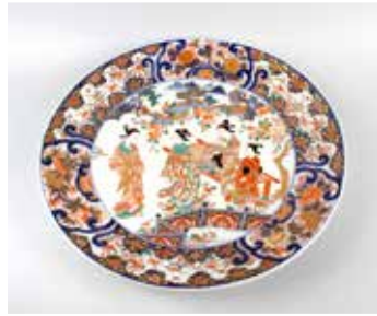
A large early 20th century Japanese porcelain charger. The dished circular field with four female 'bijin' figures in a landscape by a fence, pavilions and mountains beyond, within a border of alternate floral panels, gilt-enriched, pseudo-Chinese underglaze blue six-character mark, double ring border three painted floral sprays plus two old labels beneath, 18.25", (46.5cm) diameter. £200-250 (plus 27.6% BP*)