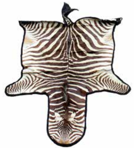
Taxidermy: a Burchell's Zebra skin rug. ( Equus quagga burchelli ), with flat head, preserved on a black baize backing, 97.5", (247.5cm) long. Please note: as there are approximately 240,000 Burchell's Zebra in the wild, this species is not on the endangered list and does not require a CITES permit for export. £250-350 (plus 27.6% BP*)