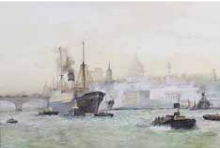
H Kendall (20th century), watercolour, Thames river scene with merchant ship and tug boards, signed and dated 1974, 11" x 16.5" (28cm x 42cm). £50-80 (plus 27.6% BP*)