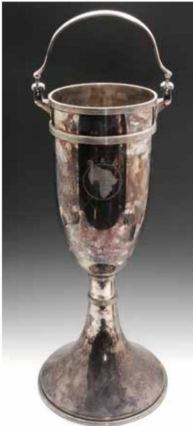
A large silver plated standing champagne cooler with personal engraving, reeded borders and swing handle. Height measuring 23 1/2 inches (60 cm). £80-120 (plus 27.6% BP*)