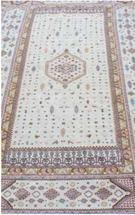
A large Eastern wool 'garden' carpet. The cream field with hexagonal central medallion bordered by trees, animals and birds, 239" x 130", (607cm x 330cm). £100-150 (plus 27.6% BP*)