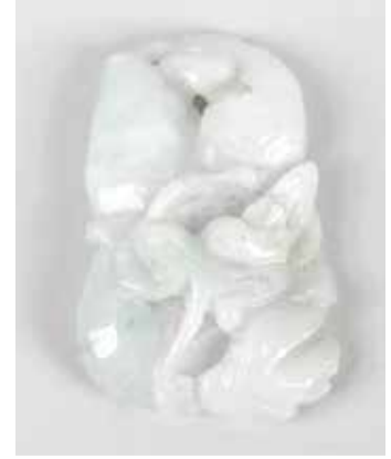
A Chinese carved jade (jadeite) double gourd. With tied waist, 1.5", (3.7cm) high. £70-100 (plus 27.6% BP*)