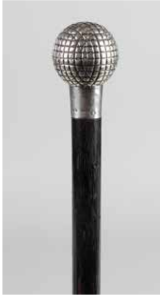
A late 19th century walking cane, the novelty London 1892 hallmarked silver handle modelled as a golf ball, the banded collar impressed 'Brigg' and engraved H C G upon an ebonised cane, 32.5" (82.5cm) long. £200-300 (plus 27.6% BP*)