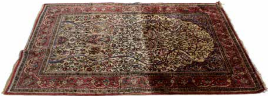
An early 20th century Indian silk rug, the gold, blue and red coloured ground with central pane depicting the tree of life, 79" x 51.5" (200.75cm x 131cm). £250-350 (plus 27.6% BP*)