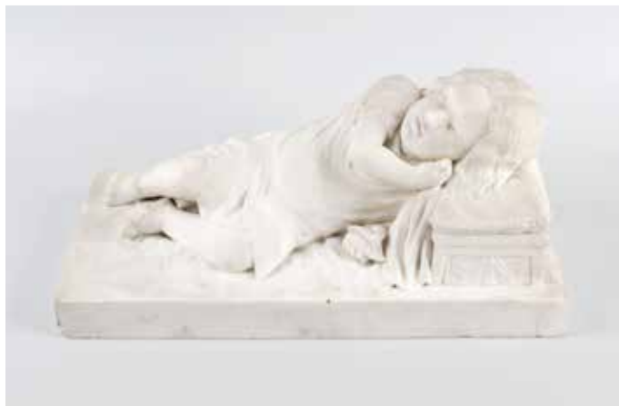
A late 19th century Carrara white marble figure of a young girl. Modelled in recumbent pose with head resting upon an ottoman, with plinth base, 15.5" x 7.5" x 7.5" high, (39.5cm x 19cm). £200-300 (plus 27.6% BP*)