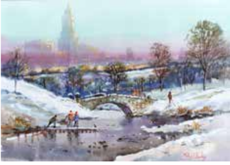
Michael Crawley (Modern), watercolour, view of New York, titled verso 'Winter the lake', Central Park, New York, 12" x 17" (30.5cm x 43.25cm), signed. £70-90 (plus 27.6% BP*)