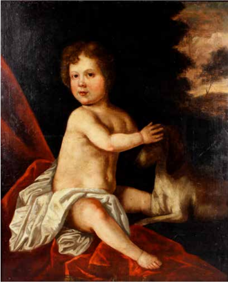
English School, late 17th century, A portrait of a child with dog circa 1680-1700, the child, patting the head of the gundog reclining beside him, seated with white mantle before a red curtain and wooded landscape, oil on canvas (relined), 29.25" x 24.25", (74cm x 61.5cm), in ebonised moulded frame, (a/f). £800-1,200 (plus 27.6% BP*)