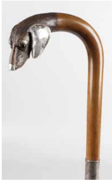
A 19th century walking cane, the carved wooden handle modelled as the head of a hound, with applied white metal details to snout, ears and inset amber glass eyes, 36.5" (92.5cm) long. £300-400 (plus 27.6% BP*)