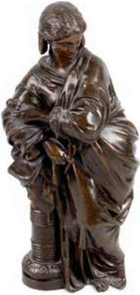
A 19th century bronze figure of a Muse. Modelled as a classical-style female figure wearing full-length robes and holding a miniature bust in her left hand, a pen or sculptor's punch in her right, resting upon a book upon a pedestal, 12.5", (32cm) high. £200-300 (plus 27.6% BP*)