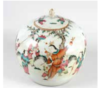
A 19th century Chinese porcelain jar of globular shaped form, the white glazed ground decorated with figures gathered beneath a prunus tree, with associated cover, 9.5" (24cm) high. £80-120 (plus 27.6% BP*)