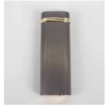
A Must de Cartier cigarette lighter, of slender oblong form with brushed steel body and gold coloured banding, 2.75" (7cm) long, in fitted maker's case. £60-90 (plus 27.6% BP*)