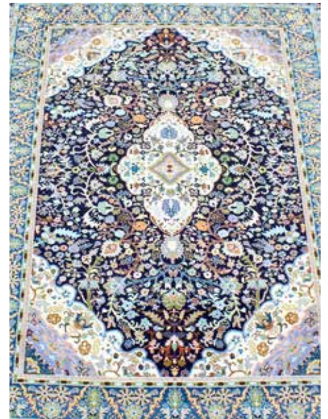
A Moroccan rug wool rug. The indigo field with central medallion and spandrels, within powder blue border, 120" x 79" together with a circular example having all-over guls, 97", (246cm) diameter, (2). £50-80 (plus 27.6% BP*)

BP* - Buyer's Premium of 23% (plus VAT) or 27.6% (VAT included)