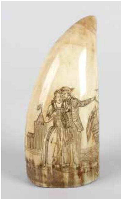
A 19th century scrimshaw-decorated sperm whale tooth, decorated in typical style with a 'Sailor's Farewell' scene, 3", (7.5cm) long. £100-150 (plus 27.6% BP*)