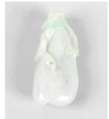
A Chinese carved jade (jadeite) gourd. The whole of celadon hue, 1.5", (3.8cm) high. £50-80 (plus 27.6% BP*)

BP* - Buyer's Premium of 23% (plus VAT) or 27.6% (VAT included)