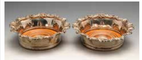
A pair of Sheffield plate bottle coasters of circular form, the flared rim with applied foliate scroll and shell border, to a turned fruitwood base with inset central button. Each struck with double sun mark and attributed to Matthew Boulton, also struck with letter H? in between. Maximum diameter measuring 6 7/8 inches (17.5 cm). £100-150 (plus 27.6% BP*)