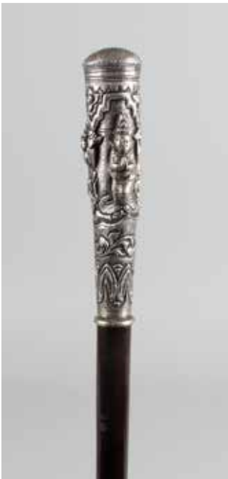
A 19th century walking cane, the Eastern white metal handle, decorated with a band of figures, with further scroll and floral details on slender stained wooden cane, 33.5" (85cm) long. £80-100 (plus 27.6% BP*)