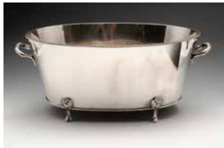
A large silver plated champagne bath cooler, of oval outline with twin handles and reeded rim, on four lion head and paw feet. Stamped GSS EP beneath. Length inclusive of handles 21 inches (53.5 cm). £100-150 (plus 27.6% BP*)