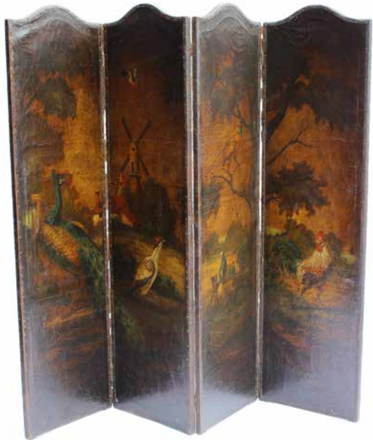
A good 18th century Dutch painted leather four-fold screen. Each fold of humped design, painted with assorted birds including a cockerel and peacock in a landscape with windmill, the borders studded, the whole with rich patination, 84" wide x 74.75" high, (213.5cm x 190cm). £300-400 (plus 27.6% BP*)