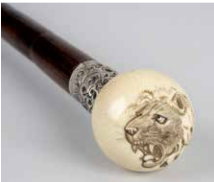
A 19th century walking cane, the Japanese Meiji period spherical shaped handle carved to its top with the face of a lion, upon a silver collar (a/f), and bamboo cane, 33.75" (85.5cm) long. £60-100 (plus 27.6% BP*)