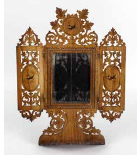
An Italian Sorrento ware inlaid olive wood dressing mirror. Of triptych form, the pierced central cresting and conforming hinged doors each decorated with swallows, framing a bevelled mirror plate, on pierced base with folding shelf, the rear with hinged easel support, 16", (40.5cm) high. £90-140 (plus 27.6% BP*)