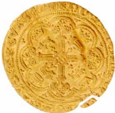
Edward III (1327-1377), Fourth coinage, Pre-Treaty Period (1351-1361), gold Half-Noble, i.m. Cross 3(4) (S.1498). Fine, legends weak, scrapes to obverse, chipped. £300-400 (plus 27.6% BP*)