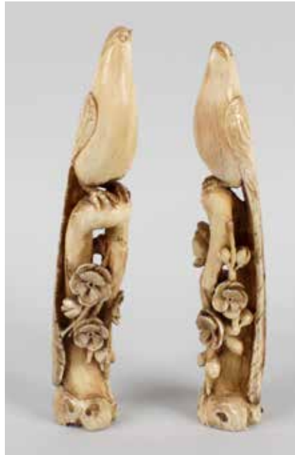
A pair of 19th century ivory carvings, each modelled as an exotic bird seated upon the branch of a blossom tree, largest 8.5" (21.5cm) high. £50-80 (plus 27.6% BP*)