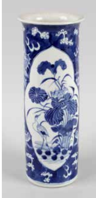
A 19th century Chinese blue and white porcelain sleeve vase, of cylindrical shaped form with flared collar, with painted panels depicting flowers and herons, blue four character mark to underside of base, 10.5" (26.75cm) high, (a/f). £120-180 (plus 27.6% BP*)