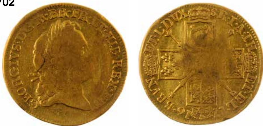
George I, gold Guinea 1716 (S 3631). Fine, some flatness to centres, a little crimped. £200-300 (plus 27.6% BP*)