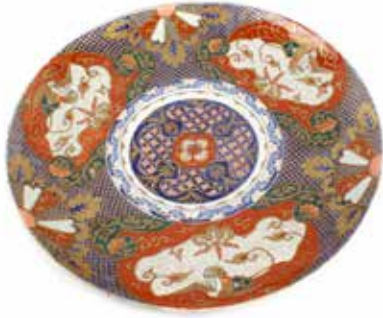
A large early 20th century Japanese porcelain charger. The dished circular field with central quatrefoil within cruciform diaperwork and shaped panels of birds reserved on a gilt and blue scale ground, flowerhead signature mark beneath, 21.75", (55cm) diameter. £200-250 (plus 27.6% BP*)