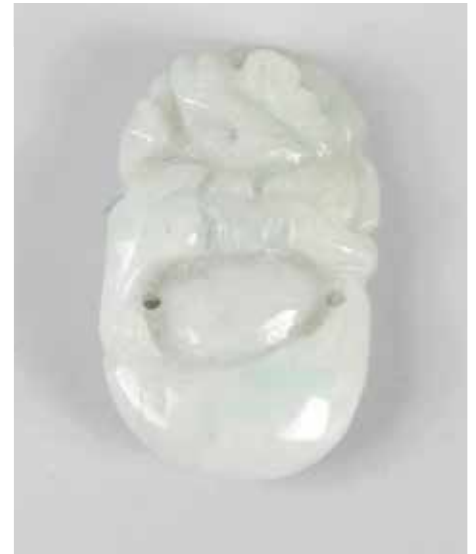
A Chinese carved jade (jadeite) figure of a qilin or kylin. Modelled in standing pose looking over its back, upon a sliced fruit or similar, the whole of pale celadon hue, 1.4", (3.7cm) high. £50-80 (plus 27.6% BP*)