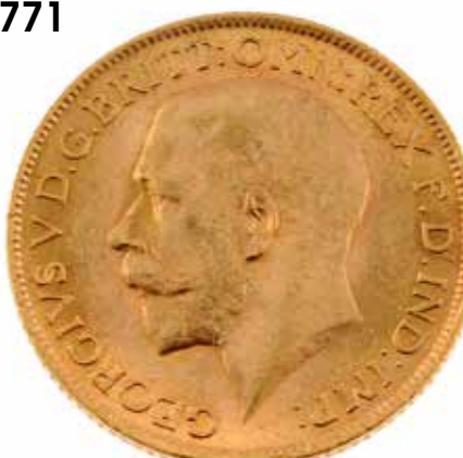
George V, Sovereign 1913. Very fine. £180-240 (plus 27.6% BP*)