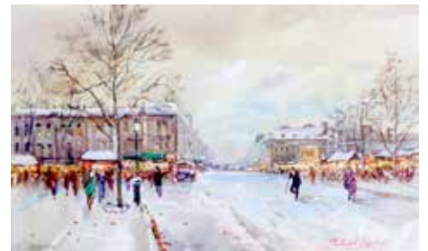
Michael Crawley (Modern), watercolour, Parisian street scene, titled verso 'Snowy day - Montmartre, Paris', 7.5" x 12.5" (19cm x 31cm), signed. £50-80 (plus 27.6% BP*)