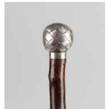
A 19th century walking cane, the white metal ball shaped handle with applied entwined metal wirework decoration, upon a white metal collar, impressed 'Brigg', 35" (89cm) long. £60-80 (plus 27.6% BP*)

BP* - Buyer's Premium of 23% (plus VAT) or 27.6% (VAT included)