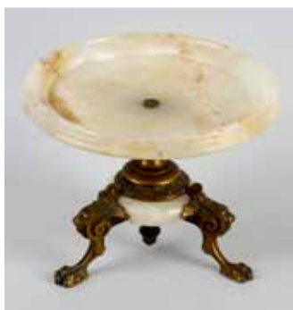
A late 19th century tazza, the onyx circular top with raised moulded edge upon a turned gilt bronze column, terminating upon an onyx base raised upon three gilt bronze lion paw feet, 6.5" (16.5cm) high. £60-80 (plus 27.6% BP*)