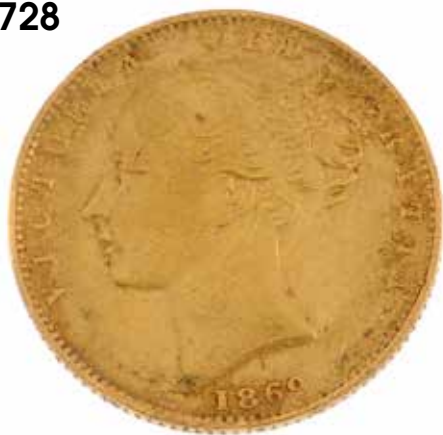
Victoria, Sovereign 1869, young head, rev. shield, die 43. Very fine, previously mounted. £200-300 (plus 27.6% BP*)