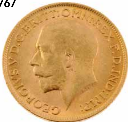
George V, Sovereign 1912. Very fine. £180-300 (plus 27.6% BP*)