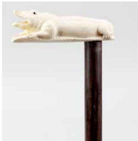
An ivory-handled hardwood walking stick or cane. The 5-inch long handle realistically modelled as a crocodile with open jaws, black eyes and folded tail, on turned hardwood shaft, 33.5" (85cm) long overall. £100-150 (plus 27.6% BP*)