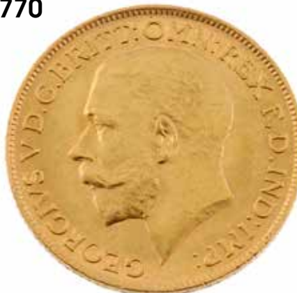
George V, Sovereign 1913. Very fine. £180-240 (plus 27.6% BP*)