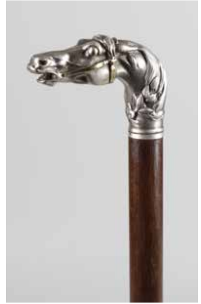
An early 20th century walking cane, the silvered bronze handle modelled as the head of a horse, upon a slender mahogany cane with applied white metal collar, formed as a buckled belt, engraved 'Major D C Peart', 35.5" (90cm) long. £150-200 (plus 27.6% BP*)