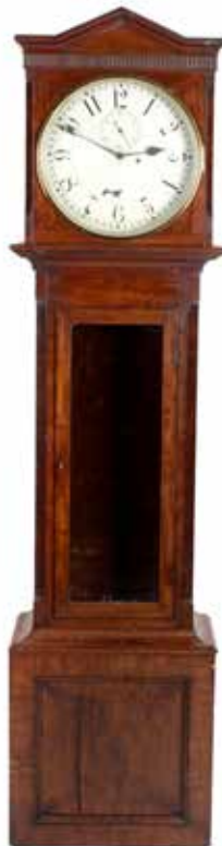
A 19th century mahogany-cased 'Domestic Regulator' longcase clock. The 14-inch white circular Arabic dial having subsidiary seconds dial, with knopped four-pillar 30-hour movement, the case with pointed pediment over brass bezel between canted corners, the glazed long trunk door also between canted corners on panelled base, 78", (198cm) high. £300-400 (plus 27.6% BP*)