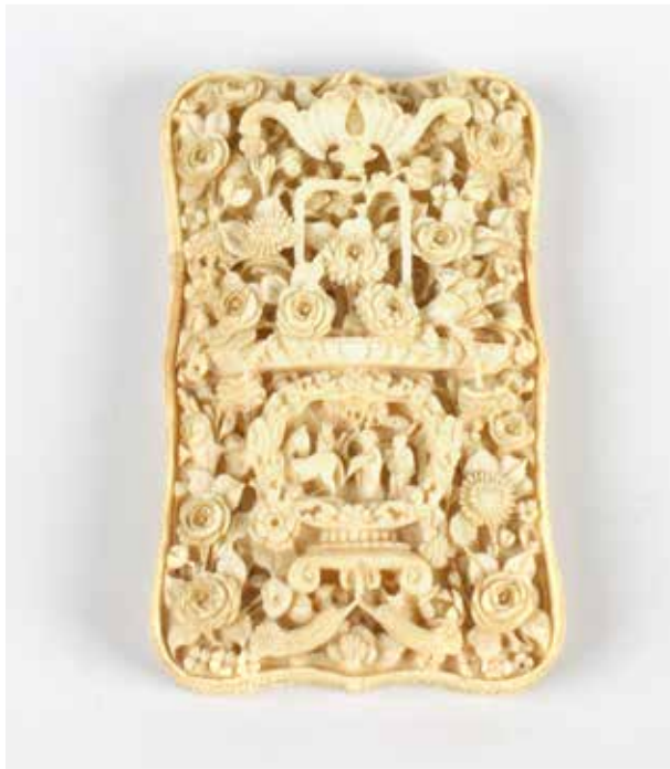
A fine late 19th century Chinese Canton carved ivory card case, of shaped oblong form, the front intricately worked with small central figural scene surrounded by flowers, the carved reverse depicting village scene with figures amongst pagodas and blossoming trees, 4.25" x 2.5" (11cm x 6.5cm). £500-700 (plus 27.6% BP*)