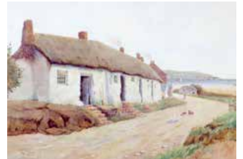
W Thomas (late 19th century), watercolour, titled verso 'Thatched cottages, Innishfree island, Co Galway', 13" x 19" (33cm x 48.25cm), signed and dated 99. £60-80 (plus 27.6% BP*)