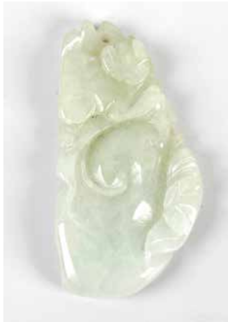
A Chinese carved jade (jadeite) vegetable group. Surmounted by a mythical beast, perhaps a qilin/kylin, the whole of celadon hue, 1.75", (4.5cm) high. £50-80 (plus 27.6% BP*)