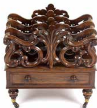
A William IV or early Victorian rosewood canterbury. Of three foliate scroll-carved compartments with turned spacers over moulded rectangular base, moulded drawer stamped 467, and four turned tapering legs terminating in lacquered brass caps swivel castors, 20" x 14" x 20.5" high, (52cm x 36cm x 53cm). £400-600 (plus 27.6% BP*)