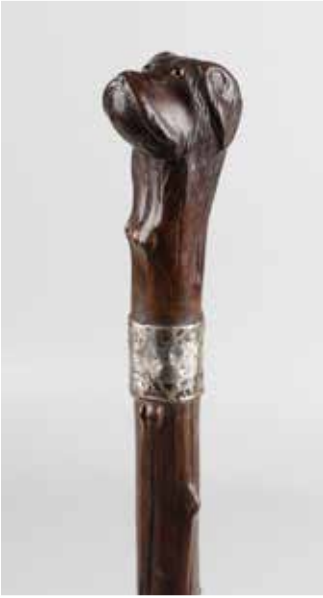
A late 19th century walking cane, the carved wooden handle modelled as the head of a dog with inset amber coloured glass eyes, upon Birmingham 1898 hallmarked silver collar and 'rustic' cane, 36" (91.5cm) long. £80-120 (plus 27.6% BP*)