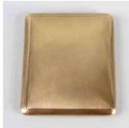
A 9ct gold cigarette case, the body of oblong form with engine turned decoration and bevelled border, opening on slide action hinges to reveal interior with personal inscription and hallmark, London 1930, 86.1 grams. 3.25" x 2.75" (8cm x 6.5cm). £900-1,200 (plus 27.6% BP*)

BP* - Buyer's Premium of 23% (plus VAT) or 27.6% (VAT included)