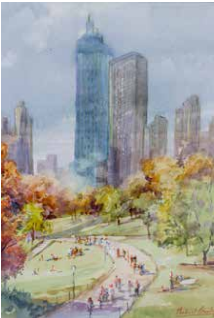
Michael Crawley (Modern), watercolour, view of New York, titled verso Central Park, New York, 12.25" x 8.5" (31cm x 21.5cm), signed. £50-60 (plus 27.6% BP*)