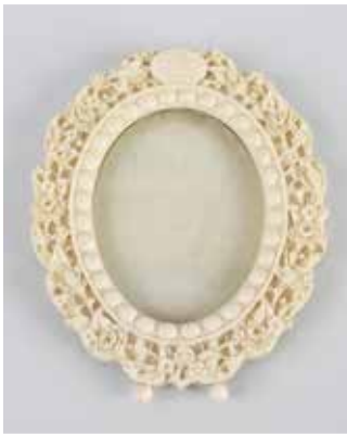
A 19th century Cantonese carved ivory oval shaped photograph frame, the glazed central panel within a moulded and floral carved shaped frame, raised upon two small ivory ball shaped feet, 5" (12.75cm) high. £50-80 (plus 27.6% BP*)