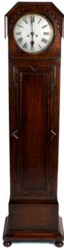
An early 20th century grandmother clock, the oak case with glazed and geometric hinged panelled door, enclosing a circular silvered dial with black Roman numerals and hands, 70" (178cm). £60-100 (plus 27.6% BP*)