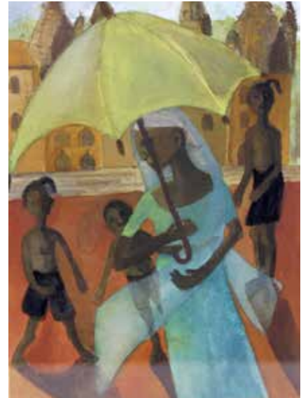
Susan-Jayne Hocking, (b.1962) 'Woman with yellow umbrella, Orcha, India 1993', watercolour, with typewritten label of New Grafton Gallery verso where stated 'signed and entitled verso', exhibited August 1994, further handwritten signed label from the artist beneath, 8" x 6", (20.5cm x 15cm), in card mount, framed under glass. £100-150 (plus 27.6% BP*)