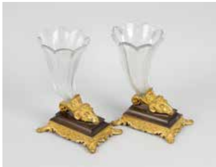
A pair of Regency bronze and ormolu epergnes. Each of cornucopia design with faceted curved glass trumpet vase to a gilt ram's head terminal, on bronze platform and foliate scroll-edged gilt apron with scroll feet, 7.5", (19cm) high, (2). £100-150 (plus 27.6% BP*)