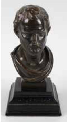
A 19th century bronze bust, modelled as a bearded classical male, on stepped marble base, 8.25" (21cm) high. £100-150 (plus 27.6% BP*)