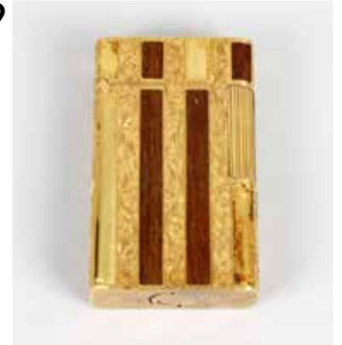
An 18k yellow metal and hardwood-inlaid lighter. The oblong Rollagas-type body having alternate strips of foliage-engraved decoration and of hardwood (losses), stamped beneath '750', 2.3", (6cm) high, (a/f). £60-90 (plus 27.6% BP*)