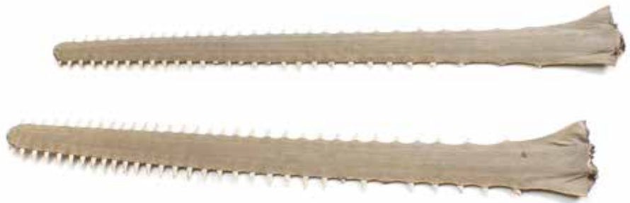
Taxidermy: two sawfish rostrums, largest 47" (119.5cm) long, sold with two individual Article 10 CITES licences, (2). £150-200 (plus 27.6% BP*)