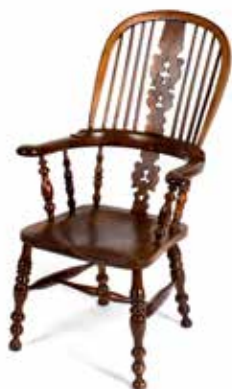
A good 19th century elm-seated yew Windsor armchair. The yew hoop, tubular spindles and shaped splat over outscrolled 'smoker's bow' style yew arms and spindle supports, the elm saddle seat on four turned yew legs with H-stretcher, 45", (114cm) high. £600-800 (plus 27.6% BP*)