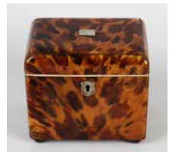
An early 19th century blonde tortoiseshell tea caddy of small proportions. The rectangular body with hinged pewter-strung cover having a central cartouche within rounded edges, enclosing a single lidded compartment, over shield escutcheon on later octagonal feet, 4.75" x 3.5" x 4.25" high, (12cm x 9cm x 11cm). £300-400 (plus 27.6% BP*)

BP* - Buyer's Premium of 23% (plus VAT) or 27.6% (VAT included)