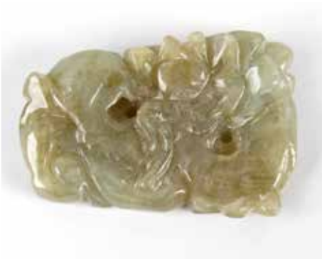
A Chinese carved jade (nephrite or dark jadeite) dragon. Modelled in resting pose looking over its back, the whole of olive green translucent hue, 1.6", (4cm) wide. £50-80 (plus 27.6% BP*)