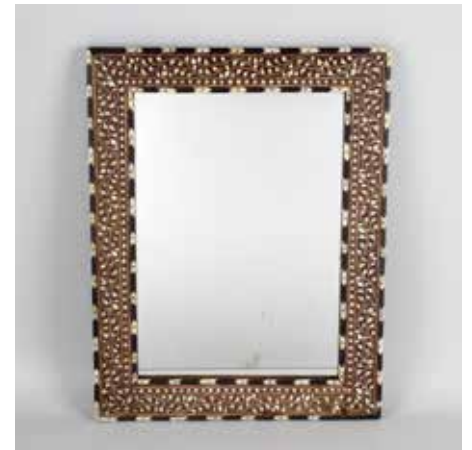
A 19th century Anglo Indian wall mirror, the rectangular hardwood frame with ivory inlaid decoration and ebony banding, 13.5" x 9.5" (34.25cm x 24cm). £60-100 (plus 27.6% BP*)