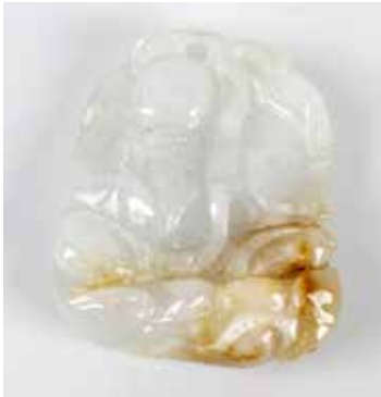
A Chinese carved jade (jadeite) figure of Jurojin. The bearded sage modelled in seated pose holding a staff, the whole of pale celadon hue with areas of russet to base, 2", (5cm) high. £120-180 (plus 27.6% BP*)