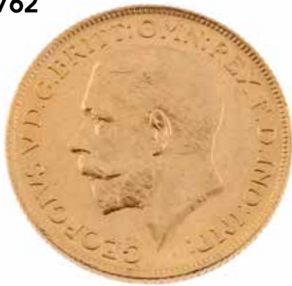
George V, Sovereign 1911S. Good very fine. £180-240 (plus 27.6% BP*)