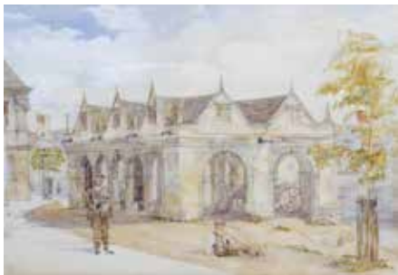
N. W. Harrison, (early 20th century), [Chipping] 'Campden Market Hall', watercolour, signed with initials lower left, entitled 'No 3 Campden Market Hall' and with artist's address (Oxford) in sepia ink to label verso, 7.5" x 11", (19cm x 28cm), in gilt card mount and gilt frame under glass. £30-50 (plus 27.6% BP*)