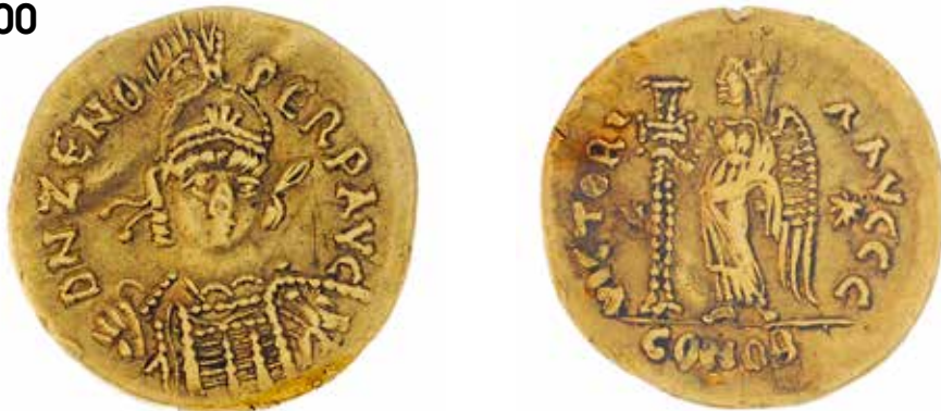
Roman Empire, Zeno (AD 476-491), gold Solidus, Constantinople mint, bust facing, rev. Victory, 3.3g. Good fine, crease mark, small scratch to obverse field and XP graffito in reverse field. £100-150 (plus 27.6% BP*)