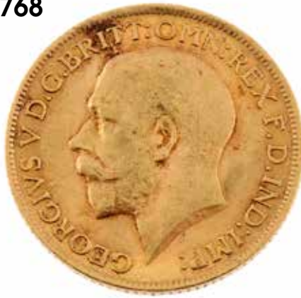
George V, Sovereign 1912. Very fine. £180-240 (plus 27.6% BP*)