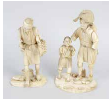
A late 19th century Japanese sectional carved ivory okimono figure group (a/f), together with two other similar examples (also a/f), etc. £80-100 (plus 27.6% BP*)