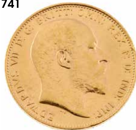
Edward VII, Sovereign 1907. Very fine. £180-240 (plus 27.6% BP*)