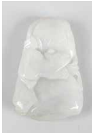
A Chinese carved jade (jadeite) double vegetable group. Modelled with mouse or rat between, the whole of celadon hue, 1.9", (4.8cm) high. £80-120 (plus 27.6% BP*)