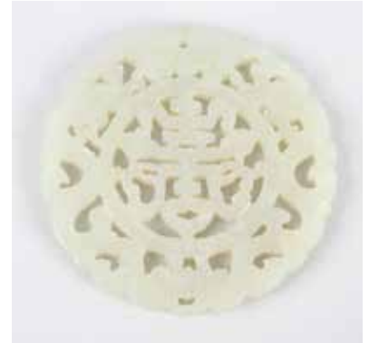
A Chinese carved jade (jadeite) bi disc. Modelled with pierced auspicious characters within open scroll border, 2.3", (6cm) diameter. £300-500 (plus 27.6% BP*)