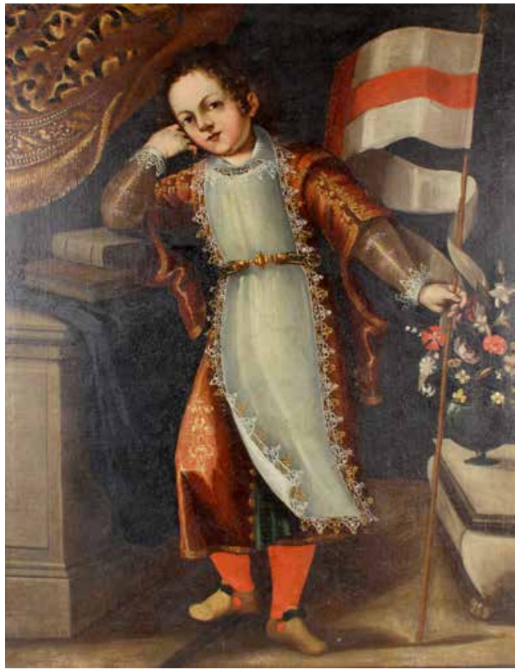
Early 19th century Spanish School, oil on canvas, full length portrait study of a young boy dressed in court regalia, holding a flag, 35" x 27" (89cm x 68.5cm). £600-800 (plus 27.6% BP*)