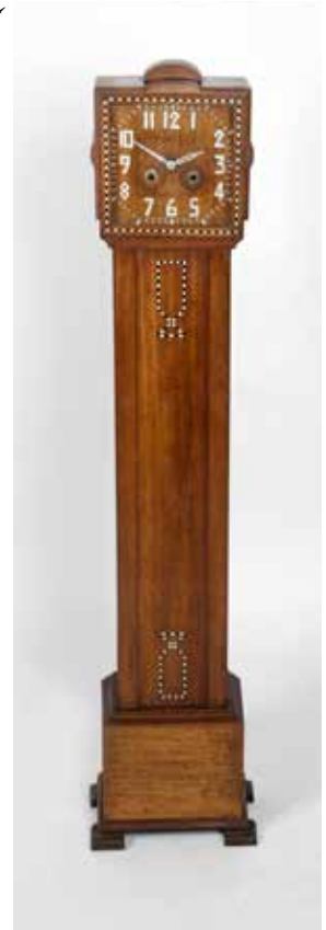
An Art Deco inlaid walnut grandmother clock. Haller, Germany, The 6.5-inch square dial with inlaid ivory Arabic chapters, the two-train movement stamped 'Haller Foreign', striking on a coiled gong, the case with humped surmount over chequer-inlaid glazed door and conforming trunk, the plain base on block feet. 46", (117cm) high. £60-90 (plus 27.6% BP*)