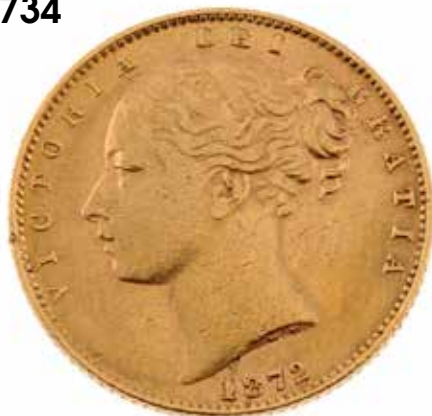
Victoria, Sovereign 1872, rev. shield, die 2. Very fine. £200-250 (plus 27.6% BP*)