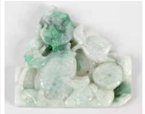
A Chinese carved jade (jadeite) figure of a boy with carp. Ruyi bats and coin to the reverse, the whole of celadon hue with areas of emerald green, 2.5" wide x 2.25" high, (6.5cm x 5.5cm). £150-200 (plus 27.6% BP*)