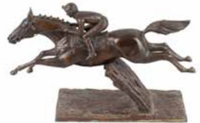
David Cornell, (modern), 'Desert Orchid', a cast bronze figure of the famous horse with jockey vaulting a hedge, the naturalistic rectangular base entitled and signed, 8.75" long x 5.75" high, (22cm x 14.5cm). £150-200 (plus 27.6% BP*)