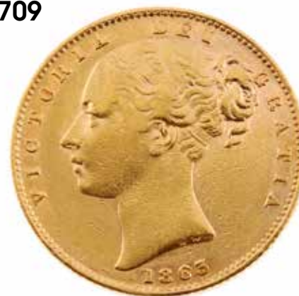
Victoria, Sovereign 1863, rev. shield. Good very fine. £220-280 (plus 27.6% BP*)