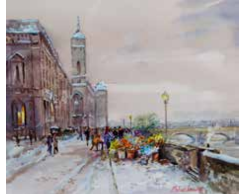
Michael Crawley (Modern), watercolour, Parisian scene, titled verso Flower sellers in the snow, Paris, 7.5" x 9" (19cm x 22.75cm), signed. £50-60 (plus 27.6% BP*)