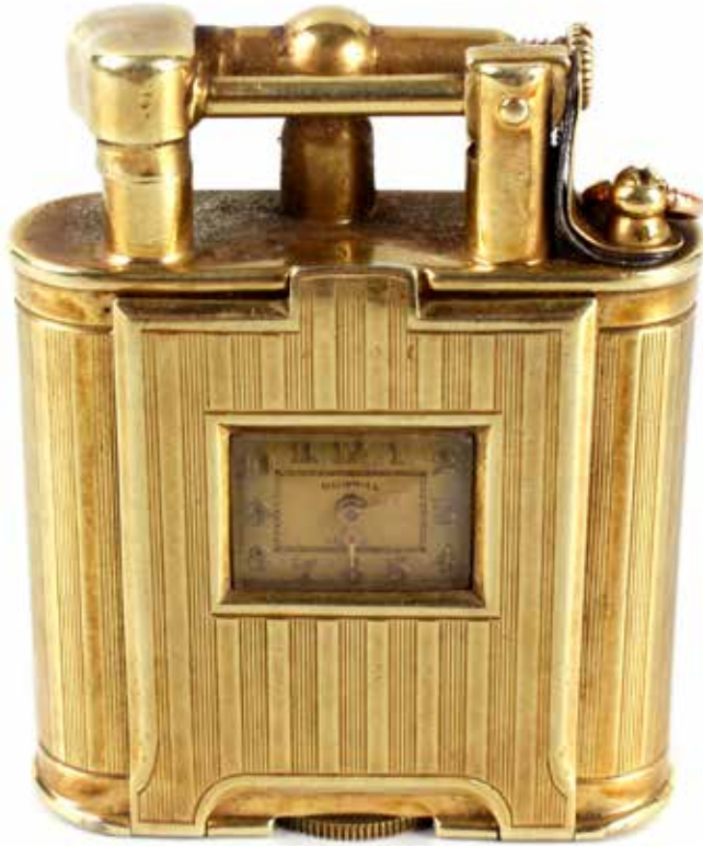
A 14kt gold Dunhill watch 'unique lighter' with roller mechanism and hinged arm, the engine turned oblong body with hinged opening door having inset watch with cream dial and Arabic numerals, marked Dunhill Swiss, the interior with engraved personal dedication and stamped 14C, PAT No 143752, 2" x 1.75" (5cm x 4.5cm). £1,200-1,800 (plus 27.6% BP*)