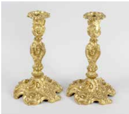
A pair of 19th century gilt bronze candlesticks, the columns of shell and scroll form upon conforming swept bases, 10" (25.5cm) high. £80-120 (plus 27.6% BP*)