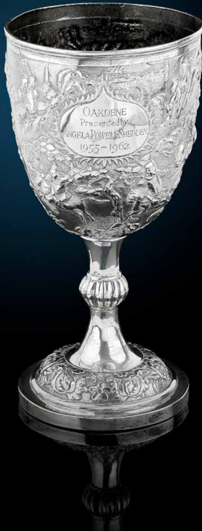
A turn of the century Chinese Export silver presentation goblet by Wang Hing & Co, the body embossed with various battle scenes depicting horseman amidst a rural landscape, engraved cartouche and raised on a knopped stem and circular foot embellished with floral band. Marked to the foot WH alongside character mark and 90. Height measuring 10 1/2 inches (26.5 cm), weight 19.8 oz (618 grams). £800-1,200 (plus 27.6% BP*)