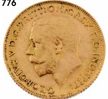
George V, Sovereign 1925. Very fine. £180-240 (plus 27.6% BP*)