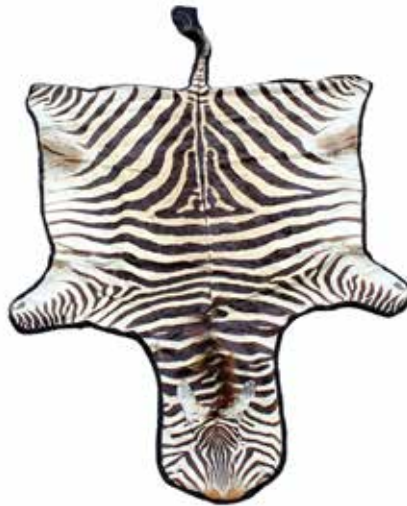
Taxidermy: a Burchell's Zebra skin rug. ( Equus quagga burchelli ), with flat head, preserved on a black baize backing, 111", (282cm) long. Please note: as there are approximately 240,000 Burchell's Zebra in the wild, this species is not on the endangered list and does not require a CITES permit for export. £250-350 (plus 27.6% BP*)