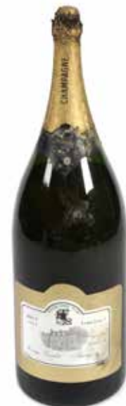
A cased Balthazar (12 litre bottle) of vintage Champagne. George Goulet, Reims, vintage 1983 Brut, low shoulder, in pine case. £50-80 (plus 27.6% BP*)