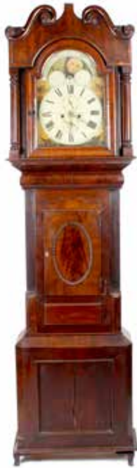
A mid 19th century mahogany-cased 8-day painted dial longcase clock. Henry Leadbeater, Congleton, Having a 14-inch break-arched Roman dial with subsidiary seconds and terrestrial calendar dials, signed H. LEADBEATER CONGLETON, the arch with rolling moon phase wheel and lunar calendar over vacant terrestrial spheres, the spandrels painted with camels and elephants representing Africa, the knopped four-pillar movement with anonymous false-plate, rack-striking on a bell, the case with swan-neck pediment having moulded scrolls over turned columns and moulded good door, the short trunk door with bead and reel-edged oval panel on canted base and ogee bracket feet, 94", (239cm) high. £200-300 (plus 27.6% BP*)