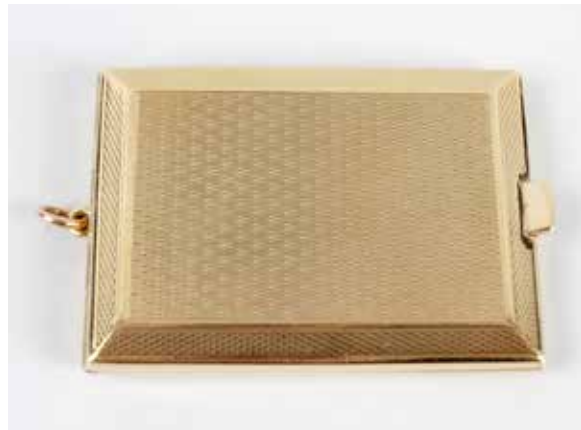
A 9ct gold vesta case, the body of rectangular form having engine turned decoration and bevelled edge border, opening on hinges with push action mechanism, hallmarked London 1928, 38 grams. 2.5" x 1.75" (6.5cm x 4.5cm). £420-520 (plus 27.6% BP*)