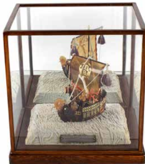
An unusual oak-cased tortoiseshell and coral model sailing boat. Perhaps representing the dragon boat of the Eight Immortals, the sail with Japanese mon motif, the tortoiseshell prow filled with precious objects (perhaps from Buddhist or Taoist religion) including white and pink coral, palm leaves, model drum, vase, mallet etc., the boat with cockerel prow having pearl-set wings, on a plush base textured to simulate waves, presentation plaque for the Golden Jubilee of the Nissan Fire & Marine Insurance Co. Ltd., 6.75" long x 8" high, (17cm x 20cm), within an oak five-glass case with mirrored back, 15" x 12" x 15" high, (38cm x 30.5cm x 38cm). £200-300 (plus 27.6% BP*)