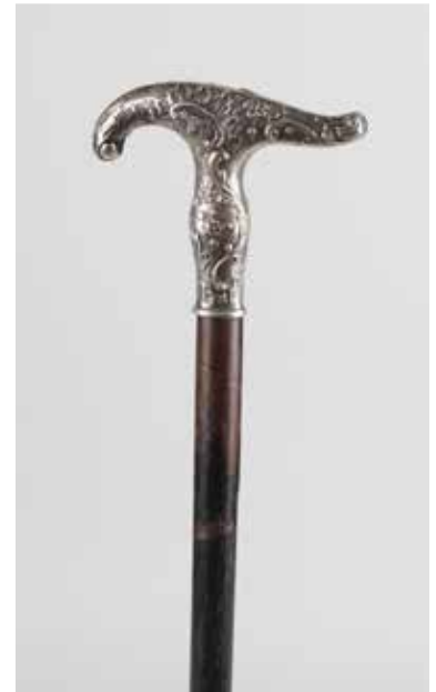
A 19th century walking cane, the white metal handle of scrolled form, with embossed floral and scroll decoration, upon a slender ebonized cane, 36" (91.5cm) long. £60-80 (plus 27.6% BP*)