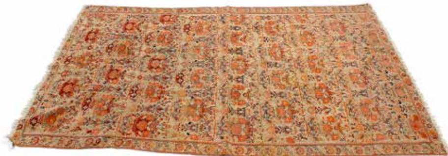
Two Caucasian rugs, the first having three rows of polychrome medallions upon a cream field, within a conforming cream border, and blue and red guard stripes 66" x 41" (168cm x 104cm), the second with repeating floral form design. £200-300 (plus 27.6% BP*)