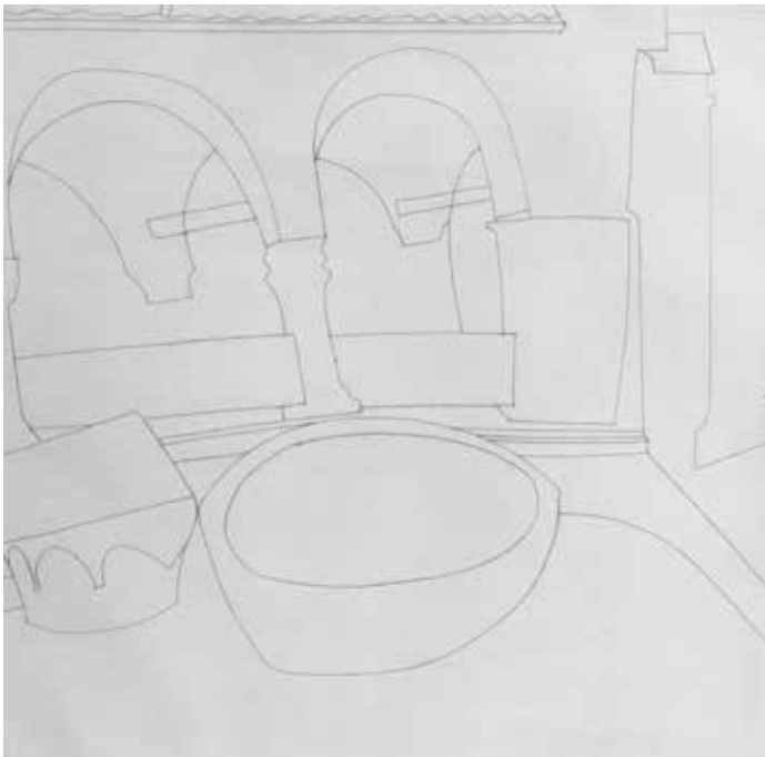
ARR Ben Nicholson, OM, (1894-1982). Torcello I (Lafranca 76; Cristea 80), etching printed with tone, 1967, on wove, signed, dated and numbered 48/50 in pencil, with the Lafranca blindstamp, published by Marlborough Graphics, London, with wide margins, 13.5" x 15", (34.5cm x 38cm), with frameless backing, glazed. £2,000-3,000 (plus 27.6% BP*)

BP* - Buyer's Premium of 23% (plus VAT) or 27.6% (VAT included)