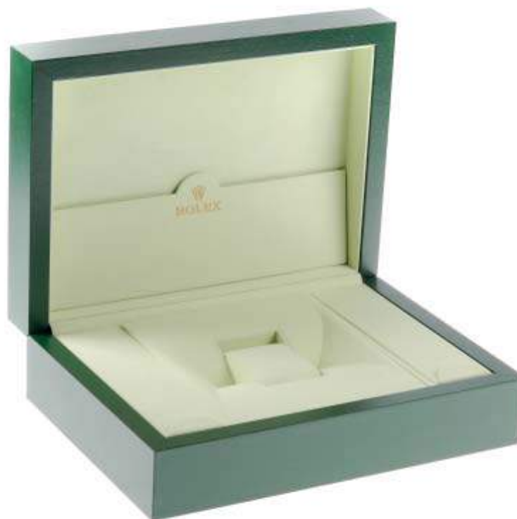
ROLEX - a complete watch box. £70-100 (plus 27.6% BP*)