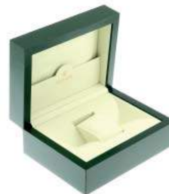
ROLEX - a complete watch box. £70-100 (plus 27.6% BP*)