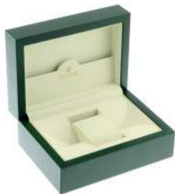
ROLEX - a complete watch box. £70-100 (plus 27.6% BP*)