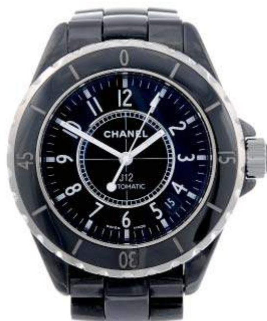
CHANEL - a lady's J12 bracelet watch. Black ceramic case with calibrated bezel and stainless steel case back. Numbered L.H.35767. Signed automatic movement with quick date set. Black dial with Arabic numeral hour markers, date aperture between four and five. Fitted to a signed ceramic bracelet with stainless steel double folding clasp. 39mm. £1,000-1,500 (plus 27.6% BP*)