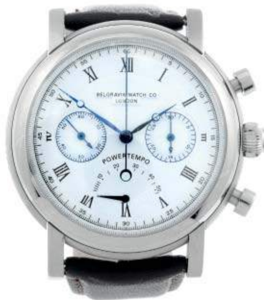
BELGRAVIA WATCH CO. - a limited edition gentleman's Power Tempo chronograph wrist watch. Number 66 of 500. Stainless steel case with exhibition case back. Reference 3455, serial B201164. Signed manual wind movement. Blue dial with Roman numeral hour markers, subsidiary recorder dials to three and nine, power reserve indicator to six. Fitted to an unsigned brown leather strap with unsigned gold plated pin buckle. 43mm. Box and papers. £180-260 (plus 27.6% BP*)