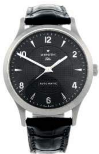
ZENITH - a gentleman's Elite wrist watch. Stainless steel case with exhibition case back. Numbered 03 1125 679. Signed automatic calibre 67. Black dial with alternating Arabic numeral and arrowhead hour markers. Fitted to an unsigned black alligator strap with stainless steel pin buckle. 37mm. £540-740 (plus 27.6% BP*)