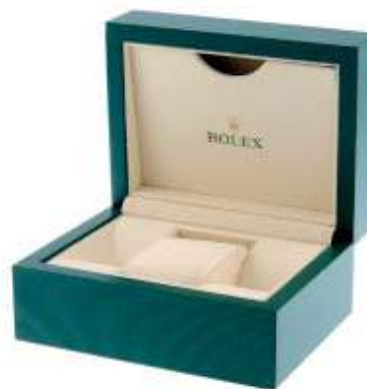
ROLEX - a complete watch box. £70-100 (plus 27.6% BP*)