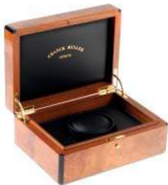
FRANCK MULLER - a complete watch box. £60-90 (plus 27.6% BP*)