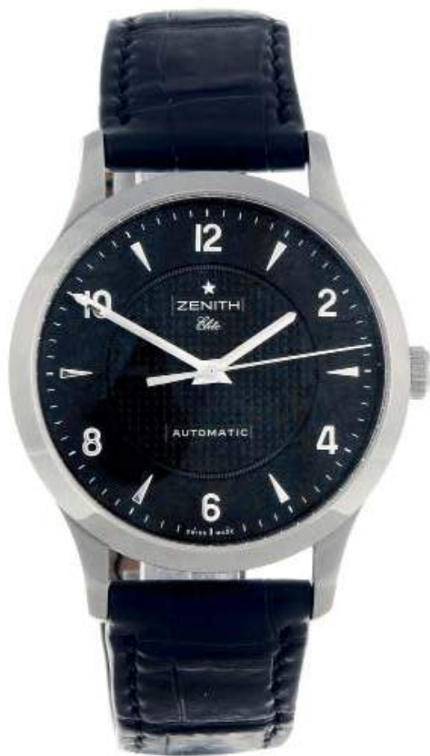
ZENITH - a gentleman's Elite wrist watch. Stainless steel case with exhibition case back. Numbered 03 1125 679. Signed automatic calibre 67. Black dial with alternating arrow head and Arabic numeral hour markers. Fitted to a signed black alligator strap with stainless steel deployant clasp. 37mm. £540-740 (plus 27.6% BP*)