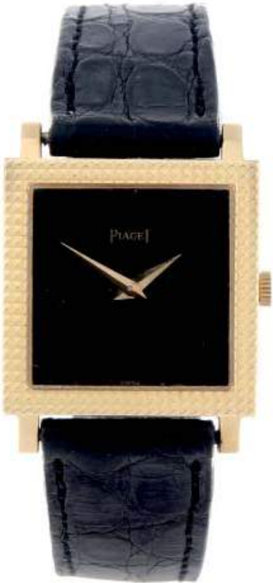
PIAGET - a lady's wrist watch. Yellow metal case, stamped 750. Reference 9357, serial 314706. Signed manual wind calibre 9P2. Black dial. Fitted to an unsigned black crocodile strap with a signed yellow metal pin buckle, stamped 750. 23mm. £300-400 (plus 27.6% BP*)