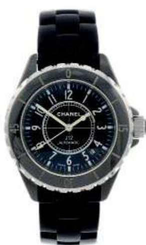
CHANEL - a J12 bracelet watch. Ceramic case with stainless steel case back and calibrated bezel. Numbered Y.E.110243. Signed automatic movement with quick date set. Black dial with Arabic numeral hour markers, date aperture between four and five. Fitted to a signed black rubber bracelet with stainless steel double folding clasp. 39mm. £800-1,200 (plus 27.6% BP*)