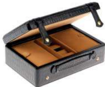
FRANCK MULLER - a complete watch box. £60-90 (plus 27.6% BP*)