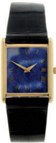
PIAGET - a lady's wrist watch. Yellow metal case, stamped 750. Reference 9286, serial 189243. Signed manual wind calibre 9P. Blue lapis lazuli dial with Roman numeral hour markers. Fitted to a signed black alligator strap with unsigned gold plated pin buckle. 23mm. £360-460 (plus 27.6% BP*)