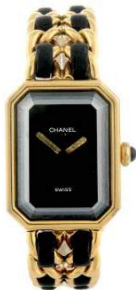
CHANEL - a lady's Premiere bracelet watch. Gold plated case. Numbered X.G.18618. Signed quartz movement. Black dial. Fitted to a signed gold plated and black leather weave bracelet with clasp. 20mm. £240-340 (plus 27.6% BP*)