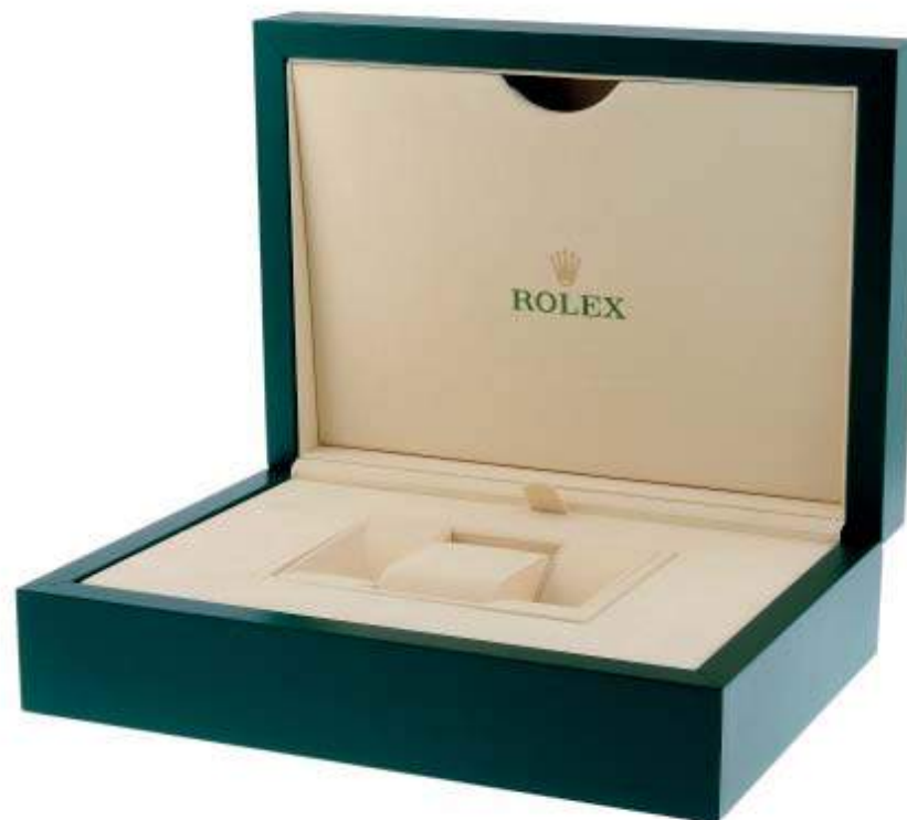
ROLEX - a complete watch box. £70-100 (plus 27.6% BP*)