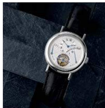
Lot 16 (front cover)