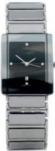
RADO - a gentleman's Tungsten bracelet watch. Stainless steel case. Numbered TU0002G. Unsigned quartz movement with quick date set. Black dial with quarterly factory white stone set hour markers, date aperture to six. Fitted to an unsigned bi-material bracelet with stainless steel deployant clasp. 27mm. £100-150 (plus 27.6% BP*)