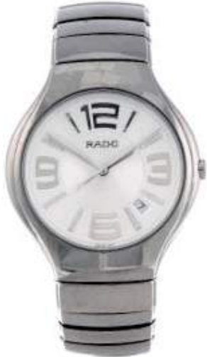
RADO - a gentleman's DiaStar bracelet watch. Ceramic case with plastic case back. Reference 115.0654.3. Unsigned quartz movement with quick date set. Silvered dial with baton hour markers, quarterly Arabic numerals, date aperture between four and five. Fitted to a signed ceramic bracelet with titanium double folding clasp. 40mm. Box. £180-260 (plus 27.6% BP*)