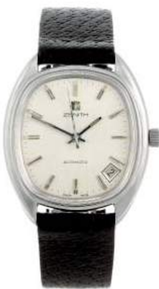
ZENITH - a gentleman's wrist watch. Stainless steel case. Numbered 01.1460.380. Signed automatic calibre 2572PC. Silvered dial with baton hour markers, date aperture between four and five. Fitted to an unsigned leather strap with stainless steel pin buckle. 35mm. £300-500 (plus 27.6% BP*)