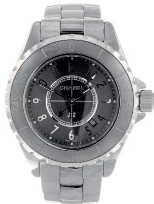
CHANEL - a lady's J12 bracelet watch. Grey ceramic case with calibrated bezel and stainless steel case back. Numbered O.M.73362. Unsigned quartz movement with quick date set. Grey dial with Arabic numeral hour markers, date aperture between four and five. Fitted to a signed grey ceramic bracelet with stainless steel double folding clasp. 34mm. Box. £900-1,400 (plus 27.6% BP*)