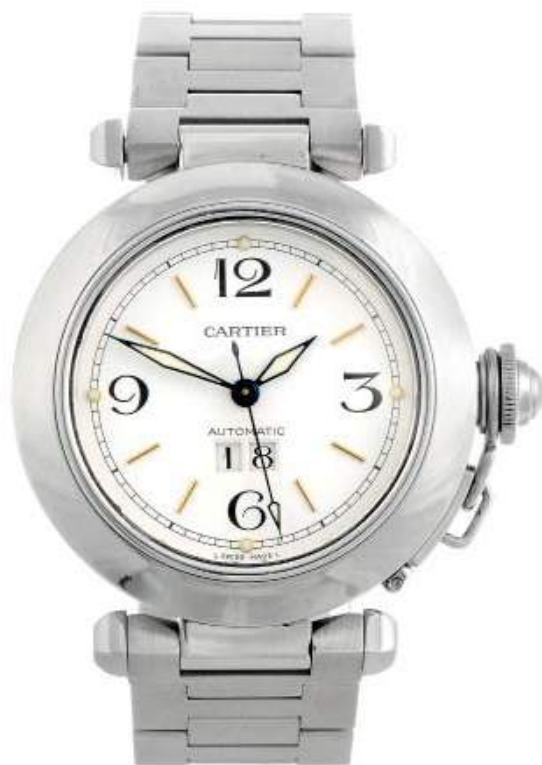
CARTIER - a Pasha bracelet watch. Stainless steel case. Reference 2475, serial 85668PB. Signed automatic calibre 052 with quick date set. White dial with baton hour markers, quarterly Arabic numerals, split date aperture to six. Fitted to a signed stainless steel bracelet with double folding clasp. 35mm. Box and papers. £1,000-1,500 (plus 27.6% BP*)