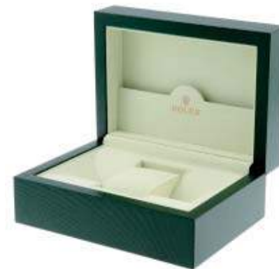
ROLEX - a complete watch box. £70-100 (plus 27.6% BP*)