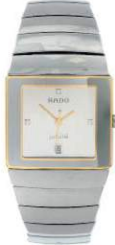
RADO - a lady's DiaStar bracelet watch. Ceramic case. Reference 152.0332.3, serial 42805431. Unsigned quartz movement with quick date set. Mirror effect dial with factory white stone set markers to three, nine and twelve, date aperture to six. Fitted to a signed ceramic bracelet with titanium double folding clasp. 28mm. £120-180 (plus 27.6% BP*)