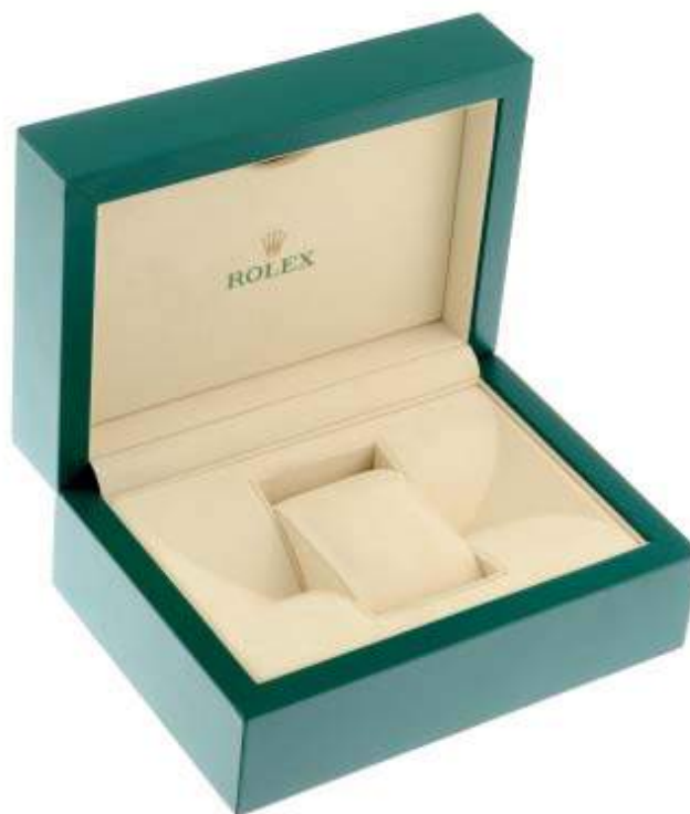
ROLEX - a complete watch box. £70-100 (plus 27.6% BP*)