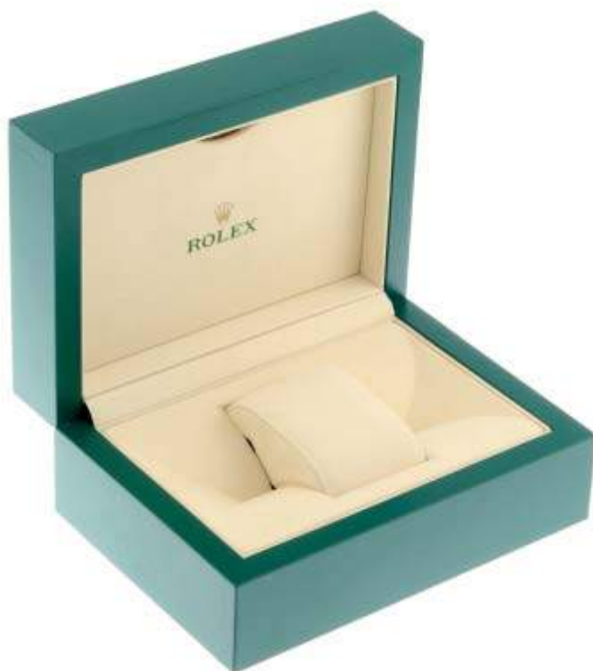
ROLEX - a complete watch box. £70-100 (plus 27.6% BP*)