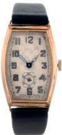
A wrist watch. 9ct yellow gold case, import hallmarked Glasgow 1930. Unsigned manual wind movement. Numbered 243, 2541. Silvered dial with Arabic numeral hour markers, subsidiary seconds dial to six. Fitted to an unsigned black leather strap with gold plated pin buckle. 22mm. £80-120 (plus 27.6% BP*)