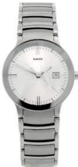
RADO - a lady's Centrix bracelet watch. Stainless steel case. Reference 111.0928.3, serial 13676746. Unsigned quartz movement with quick date set. Silvered dial with baton hour markers, date aperture to three. Fitted to a signed bi-material bracelet with titanium folding clasp. 28mm. Box. £150-200 (plus 27.6% BP*)