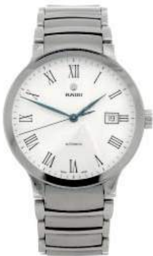
RADO - a gentleman's Centrix bracelet watch. Stainless steel case with exhibition case back. Reference 658.0939.3, serial 12323030. Signed automatic movement with quick date set. White dial with Roman numeral hour markers, date aperture to three. Fitted to a signed stainless steel bracelet with titanium folding clasp. 38mm. £150-200 (plus 27.6% BP*)