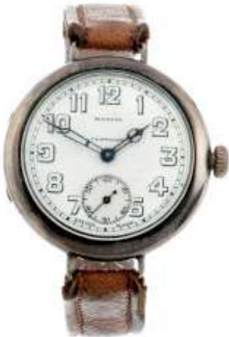
MAPPIN - a gentleman's trench style wrist watch. Silver case, import hallmarked London 1917. Unsigned manual wind movement. White dial with Arabic numeral hour markers, subsidiary seconds dial to six. Fitted to an unsigned tan leather strap with nickel plated pin buckle. 34mm. £80-120 (plus 27.6% BP*)