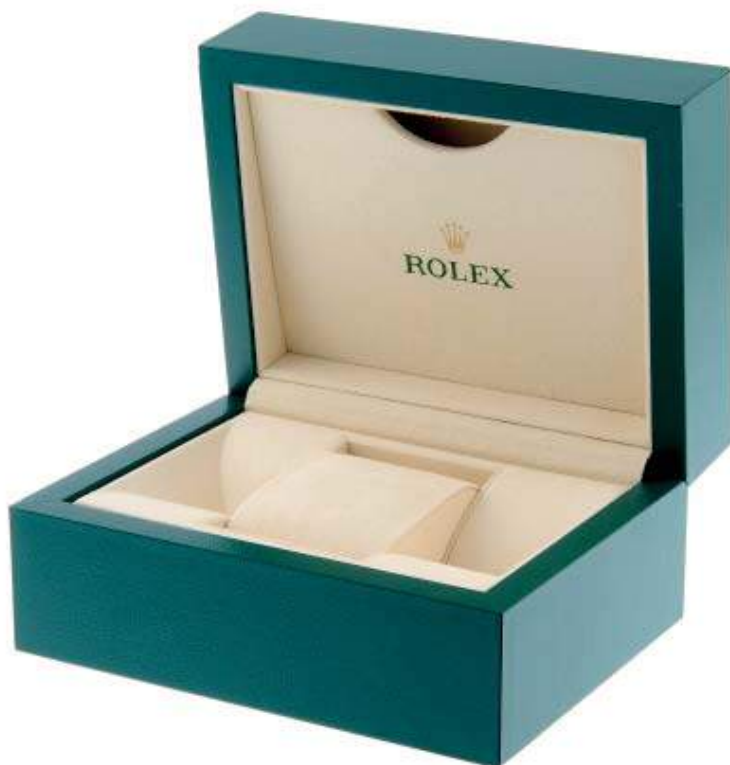
ROLEX - a complete watch box. £70-100 (plus 27.6% BP*)