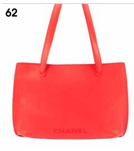
CHANEL - a vintage red leather handbag. Designed with a grained red leather exterior, featuring maker's name embroidered to the lower front, with dual leather shoulder straps, a magnetic snap button fastening and smooth red leather interior lining. Measuring 6 by 29 by 39cms . £300-400 (plus 27.6% BP*)

CHANEL - a black leather handbag. Designed with maker's CC embroidered logo to the lower front, with dual long leather top handles and two main interior compartments. Measuring 9 by 23.5 by 31cms . £350-450 (plus 27.6% BP*)