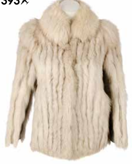
SAGA - a blue fox fur coat. Designed with a short collar, hook and eye clip fastenings, quilted leather trim and two outer pockets. Labelled Saga Fox, size 8. Chest measures approximately 34inches. £100-150 (plus 27.6% BP*)