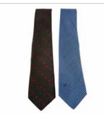
CHANEL - two silk ties. Featuring a blue and black diagonal striped tie with the make's embroidered logo to the blade end, together with a black tie designed with a red diamond pattern. Lengths measure 141 and 142cms . £30-50 ( plus 27.6% BP* )

CHANEL - two silk ties. To include a grey and black diagonal striped tie, together with a navy blue tie featuring a subtle chequered pattern with orange polka dot pattern. Lengths measure 141cms. £30-50 (plus 27.6% BP*)