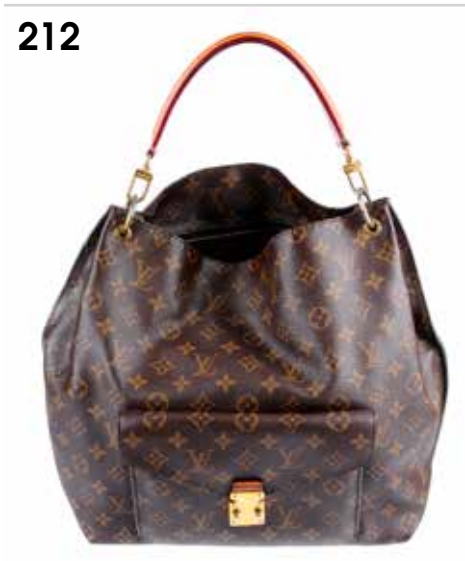
LOUIS VUITTON - a Monogram Metis hobo handbag. Featuring the maker's signature monogram coated canvas exterior with vachetta leather, a detachable leather top handle and canvas shoulder strap, gold-tone hardware, front S-lock fastened pocket, lined with brown alcantara fabric with three interior pockets. Measuring 14 by 31 by 34cms . E90-140 ( plus 27.6% BP <sup>*</sup>)

LOUIS VUITTON - a Monogram Speedy 30 handbag. Designed with the maker's monogram coated canvas exterior and natural cowhide leather trim, double rolled leather handles and a top zip fastening with maker's padlock and keys. Measuring 18 by 20 by 30cms . £200-300 (plus 27.6% BP*)