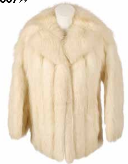
An arctic fox fur jacket. Designed with a notched lapel collar, hook and eye clip fastenings, two outer pockets and an inner side pocket. Labelled size 8. Chest measures approximately 36inches. £150-200 (plus 27.6% BP*)