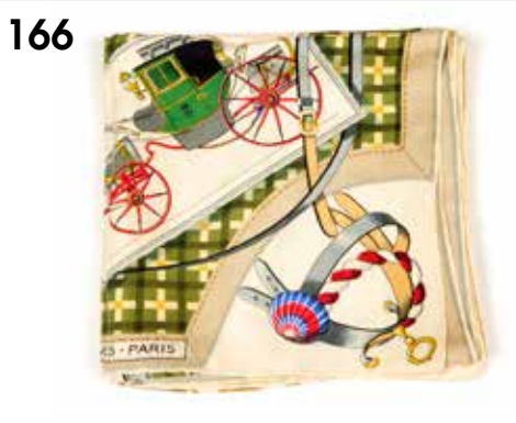
HERMÈS - a 'Les Voitures Nouvelles' silk scarf. Featuring a variety of different coaches on a green and cream plaid patterned background. Measuring 90 by 90cms . £80-120 ( plus 27.6% BP* )

HERMÈS - a 'Les Armes de Paris' silk pocket square. Designed by Hugo Grygkar, first issued in 1954, featuring an embroidered regimental pattern with a sunburst of sewing needles on a green background. Measuring 42 by 43cms. £30-50 ( plus 27.6% BP *)