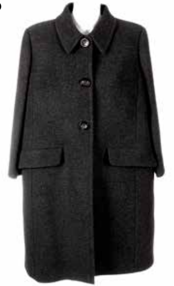
MIU MIU - a knee-length single breasted coat. Crafted from grey virgin wool, featuring a short pointed collar, front button fastenings, and a single rear vent. Labelled Miu Miu, size 50. With maker's coat hanger. £60-90 (plus 27.6% BP*)