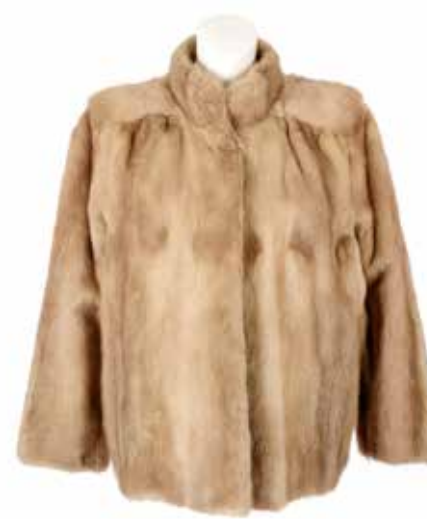
A sapphire mink jacket. Designed with a short Mandarin collar, hook and eye fastenings, two outer pockets and one inner side pocket. Chest measures approximately 44inches. £150-200 (plus 27.6% BP*)