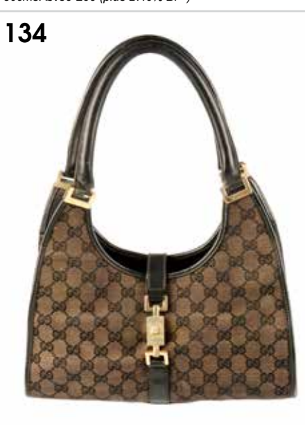
GUCCI - a Bardot handbag. Designed with maker's GG monogram canvas exterior with smooth black leather trim, dual rolled leather top handles, a piston-lock front fastening and one interior zip pocket. Measuring 8 by 26 by 30.5cms . With maker's dust bag . £40-60 (plus 27.6% BP<sup>+</sup>)

GUCCI - a Sukey Top Handle handbag. Crafted from beige monogram canvas with metallic beige leather trim, with two rolled leather top handles and an optional leather shoulder strap, a detachable logo charm, top zip fastening and a cream canvas interior lining. Measuring 12 by 24 by 30cms . £150-200 (plus 27.6% BP*)