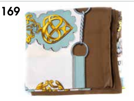
HERMÈS - an adapted 'Cuivreries' long silk scarf. Designed by Françoise de la Perriere and featured an array of equestrian buckles and harness trimmings in pale blue, brown and white. Please note this scarf has been created from two original Hermès scarves but not designed by Hermès. Measuring 28.8 by 73cms. £80-120 (plus 27.6% BP*)

HERMÈS - a 'Phaeton' silk scarf. Originally designed by Philippe Ledoux in 1958 and features a phaeton carriage in pastel grey and white with burgundy accents on a pale pink background. Measuring 90 by 90cms . £90-140 (plus 27.6% BP <sup>+</sup>)