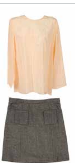
MIU MIU - a skirt and a blouse. To include a grey virgin wool calf-length pencil skirt, with front patch pockets and rear zip fastening, together with a pale pink silk shirt, featuring a lace bow collar detail and rear button fastenings. Labelled Miu Miu, size 50. With maker's coat hangers and dust bags. £50-80 (plus 27.6% BP*)