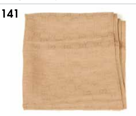
GUCCI - a beige cashmere scarf. Crafted from soft beige cashmere featuring the maker's classic GG pattern interwoven and fringed ends. Measuring 48 by 193cms. With maker's label. £50-80 ( plus 27.6% BP* )

GUCCI - two scarves. To include a blue silk scarf of chequered pattern with grey hem, together with a beige mohair scarf featuring a horsebit motif in green and red. Lengths measuring 126 by 152cms. With maker's labels. £60-90 ( plus 27.6% BP* )