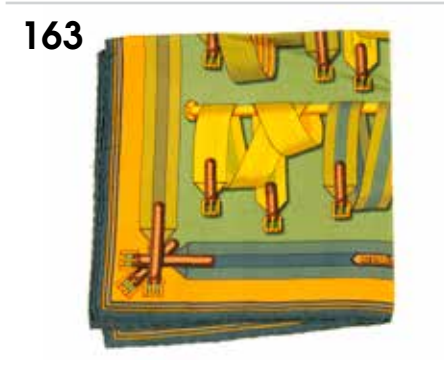
HERMÈS - a silk 'Les Sangles' pocket square. Designed by Joachim Metz, first issued in 1985, featuring hanging straps in shades of green and yellow with a border of further straps with buckle ends and a teal rolled edge. Measuring 43 by 43cms. £30-50 ( plus 27.6% BP* )

HERMÈS - an 'Ex-libris' silk scarf. Designed by Hugo Grygkar, featuring horse drawn carriages in navy and sky blue tones on a white background. Measuring 89 by 89cms. £70-100 ( plus 27.6% BP* )