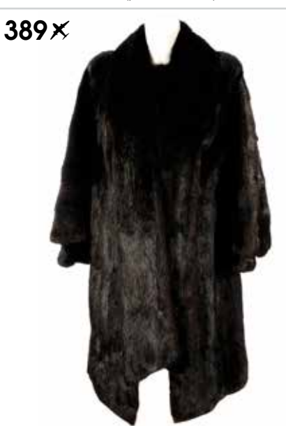
A dyed musquash knee-length coat. Featuring a long fur neck tie, wide bell sleeves and fitted cuffs, hook and eye clip fastening, two side vents and two outer pockets. Labelled Regency Furs. Chest measures approximately 38inches. £60-90 (plus 27.6% BP*)

A pastel mink coat and squirrel fur stole. The coat, designed with a lapel collar, an open front, cocktail cuffs, two outer pockets and an inner ribbon tie, together with a squirrel fur stole. Chest measures approximately 40inches, stole one size. £50-80 (plus 27.6% BP*)