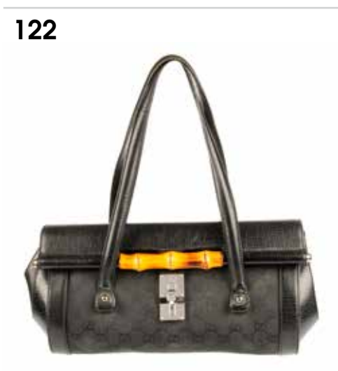
GUCCI - a Monogram Bamboo Bullet handbag. Designed with a structured cylindrical shape, featuring maker's black monogram canvas exterior with black pebbled leather trim, polished silver-tone hardware, dual leather handles, top flap closure with bamboo bar detail, front clip fastening and one interior zip pocket. Measuring 13.5 by 17 by 32cms . £100-150 ( plus 27.6% BP* )

GUCCI - a vintage lizard handbag. Crafted from brown lizard skin with gold-tone hardware, featuring a single looping top handle, front push-clip closure and a brown leather lined interior with multiple inner compartments. Measuring 4.5 by 17 by 23.5cms. £180-260 (plus 27.6% BP* )