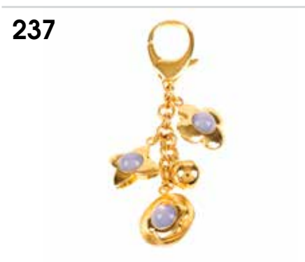
LOUIS VUITTON - a key chain. Featuring the maker's iconic monogram flowers with mauve iridescent paste centres, a logo embossed sphere on a gold-tone double link chain and large lobster clasp. Length measures 13cms. E50-80 (plus 27.6% BP<sup>+</sup>)

LOUIS VUITTON - an Ice Ball bag charm. Designed as a pink lucite ball, in a gold-tone openwork floral frame, to the lobster clasp closure. Deficient of hanging tassel accent . Length measures 11.5cms. £30-50 (plus 27.6% BP*)