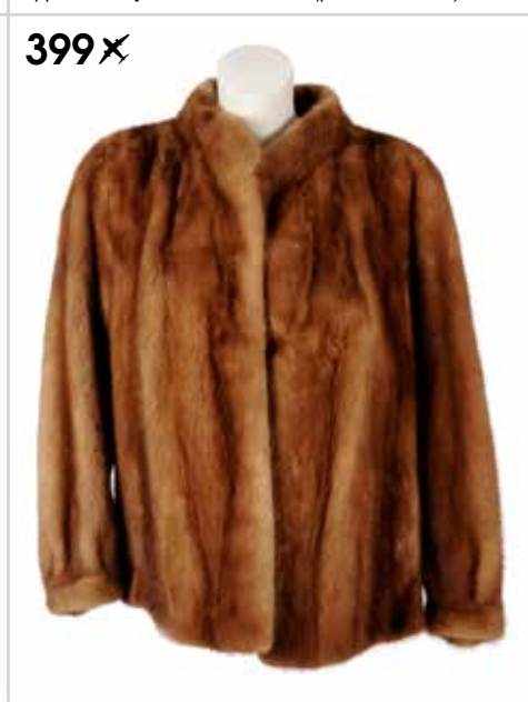
A pastel mink coat. Designed with a short Mandarin collar, hook and eye front clip fastening and fitted cuffs. Chest measures approximately 42inches. £60-90 (plus 27.6% BP*)

A dark ranch mink jacket. Designed with a notched lapel collar, hook and eye clip fastenings, cocktail cuffs, a rear half-belt and two outer pockets. Chest measures approximately 42inches . £90-140 ( plus 27.6% BP* )