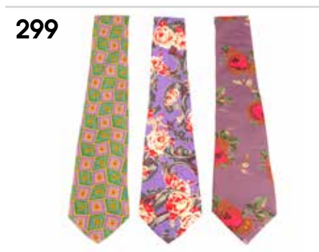
PAUL SMITH - three ties. To include a rose patterned tie on a dark purple background, a textured purple tie with a rose and foliate design and a purple and green diamond patterned tie. Lengths measure 142 to 146cms. £20-30 ( plus 27.6% BP' )

PAUL SMITH - a faux fur Pow scarf. Crafted from pink faux fur with a colourful 'Pow' pattern throughout. Length measures 100cms. With maker's tag attached. £30-50 (plus 27.6% BP*)