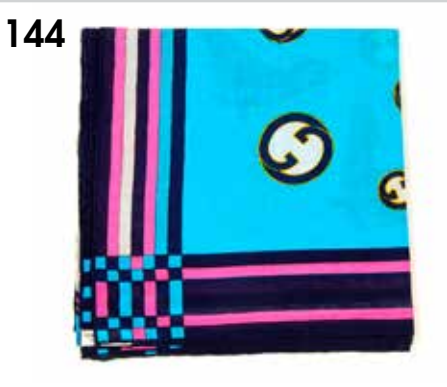
GUCCI - a cotton scarf. Designed with a pink and blue seal motif on an aqua blue background with a large circular pattern and dark blue border. Measuring 88 by 88cms . £40-60 ( plus 27.6% BP* )

GUCCI - a cotton scarf. Designed with a nautical theme featuring a school of fish in blue and white with wave patterns to the corners on a background of red with a white border. Measuring 86 by 89cms. £40-60 (plus 27.6% BP*)