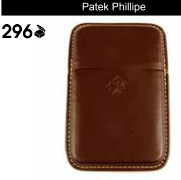
PATEK PHILLIPE - a brown leather card holder. Designed with the maker's logo crest embossed to the centre front. Measuring 1 by 6.5 by 10cms. With maker's box. £40-60 (plus 27.6% BP*)

NINA RICCI - seven ties. To include a burgundy woven textured tie, a mauve and burgundy patterned tie, a light brown tie with diagonal stripes, a navy blue and burgundy tie of similar design, a navy blue tie with a red dot pattern together with two further ties. Lengths measures 136 to 141cms. £40-60 (plus 27.6% BP*)