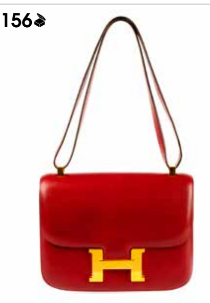
HERMÈS - a 1975 Constance handbag. Crafted from smooth burgundy leather with gold-tone 'H' fastener and hardware, front flap closure and two length handle, with a rear slip pocket, inner front pocket and inner zip compartment. Measuring 5 by 17.5 by 22.5cms. With maker's dust bag and box. £1,200-1,800 (plus 27.6% BP*)

HERMÈS - a 2015 Padded Berline messenger bag. Crafted with a red padded calfskin leather exterior, with perforated front and back panelling and polished silver-tone hardware, featuring the iconic 'Kelly' strap closure with central turn-lock fastening, with a removable crossbody strap and two interior side pockets. Measuring 8 by 21 by 28cms. With maker's dust bag. £1,500-2,000 (plus 27.6% BP*)