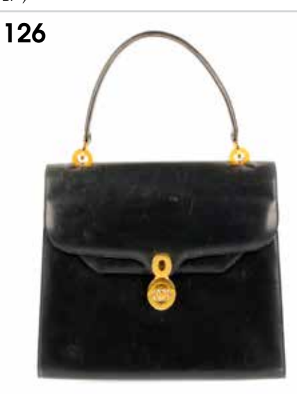
GUCCI - a vintage leather box handbag. Designed with a structured shape, with a smooth navy blue leather exterior, gold-tone hardware, a looping leather top handle, gusseted sides with red and blue Web stripe detailing, top flap closure with interlocking GG turn-clasp fastening, opening to a matching leather lined interior. Measuring 10.5 by 25.5 by 29.5 cms. £60-90 ( plus 27.6% BP* )

GUCCI - a Hasler handbag. Designed with a green suede exterior with green leather accents and large front horsebit detail, with a single leather shoulder strap and one interior zip pocket. Measuring 2 by 26 by 35cms. £100-150 ( plus 27.6% BP* )