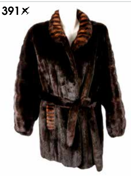
A three-quarter length ranch mink coat. Featuring striped detailing to the collar and pocket trim, with hook and eye clip fastenings, barrel sleeves, a mink waist belt and one interior patch pocket. Labelled Faulkes Edgbaston Birmingham. Chest measures approximately 44inches. £80-120 (plus 27.6% BP*)

A pastel mink coat. Designed with a notched lapel collar, hook and eye fastenings, two outer flap pockets and an inner ribbon tie. Chest measures approximately 44inches. £70-100 (plus 27.6% BP*)