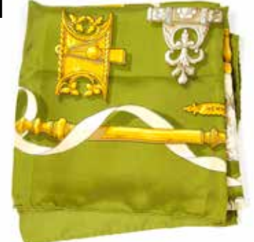
HERMÈS - a 'Ferronnerie' silk scarf. Designed by Caty Latham, featuring decorative gold ironwork on a green background. Measuring 89 by 90cms . £70-100 (plus 27.6% BP")