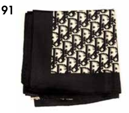
CHRISTIAN DIOR - a silk scarf. Featuring the maker's classic monogram print in black on a cream background with a thick black border and maker's logo to the lower right corner. Measuring 77 by 78cms. £50-80 ( plus 27.6% BP* )

CHRISTIAN DIOR - a vintage white leather handbag. Designed with an envelope flap closure, magnetic snap button fastening, a gold-tone chain shoulder strap and one interior zip pocket. Measuring 4 by 17 by 25cms. With maker's dust bag. £30-50 ( plus 27.6% BP* )