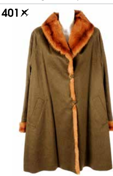
A knee-length green cashmere and mink lined coat. Featuring a lapel collar, front button fastenings and two outer pockets. Labelled Habsburg, size 16. £40-60 (plus 27.6% BP<sup>*</sup>)

A Shearling coat. Featuring a camel coloured leather exterior, with natural cream wool trim and interior lining and toggle button fastenings. Chest measures approximately 62inches. £30-50 (plus 27.6% BP*)