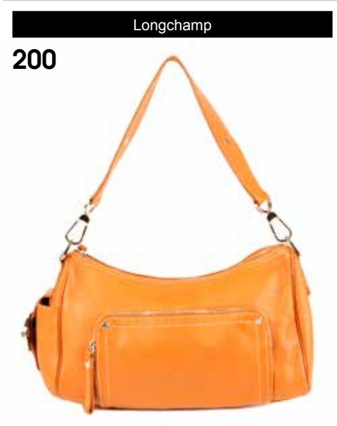
LONGCHAMP - a tan leather baguette handbag. Featuring a front zip pocket and small side pocket, detachable leather shoulder strap and maker's orange logo fabric lining. Measuring 12 by 18 by 32cams. £30-50 ( plus 27.6% BP* )

L.K.BENNETT - two black clutch evening bags. To include a black sequin embellished envelope clutch, with magnetic front fastening and silver-tone chain shoulder strap, together with a black patent leather clutch with a detachable gold-tone chain shoulder strap. Lengths measure 24 and 26.5cms. With maker's dust bags. £30-50 (plus 27.6% BP*)