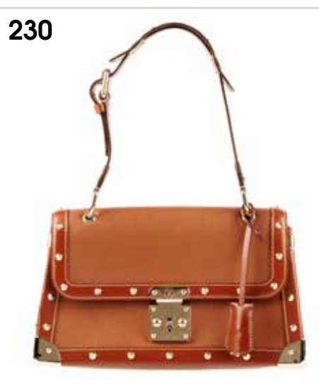
LOUIS VUITTON - a Sienne Suhali Leather Le Talentueux handbag. Designed with a structured shape, crafted from brown goatskin leather with silver-tone hardware accents, to include pointed stud detailing, corner plates and an engraved press lock fastening, with a flat shoulder strap and maker's monogram patterned lining. Measuring 9 by 16 by 31cms. With maker's dust bag. £400-600 ( plus 27.6% BP* )

LOUIS VUITTON - a Damier Azur Pochette Accessoires handbag. Crafted from the maker's damier check azur coated canvas exterior, with a detachable vachetta leather strap, top zip fastening and a cream textile lined interior. Measuring 4 by 13 by 21cms . £120-180 (plus 27.6% BP*)