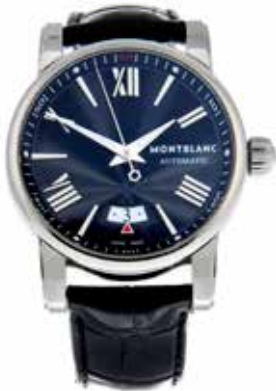
MONTBLANC - a Star wrist watch. Stainless steel case with exhibition case back. Case width 41mm. Reference 7102, serial PL756067. Signed automatic calibre 4810 401. Black guilloché effect dial with Roman numeral hour markers, date aperture to six. Fitted to a signed black leather strap with stainless steel double folding clasp. Box and papers. £600-800 (plus 27.6% BP*)