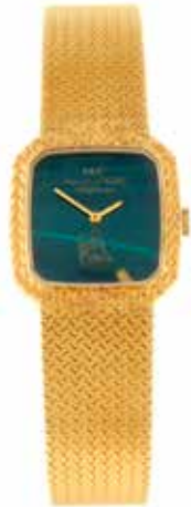
IWC - a bracelet watch. Yellow metal case, stamped 18K 0,750 with poinçon. Case width 24mm. Numbered 2255349. Signed manual wind movement. Malachite dial. Fitted to an integral yellow metal bracelet with folding clasp, stamped 0750. 62gms. £1,000-1,500 (plus 27.6% BP*)