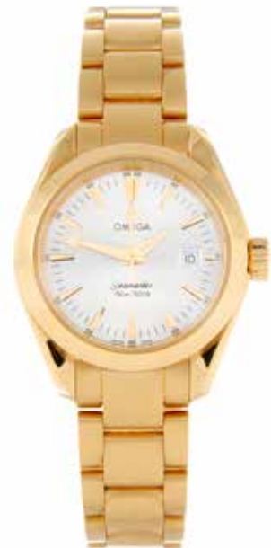
OMEGA - a Seamaster Aqua Terra bracelet watch. 18ct yellow gold case. Case width 29mm. Reference 2102.30.00, serial 58168098. Signed quartz calibre 1424 with quick date set. Silvered dial with baton hour markers, date aperture to three. Fitted to a signed 18ct yellow gold bracelet with folding clasp. 123gms. £4,000-6,000 (plus 27.6% BP*)