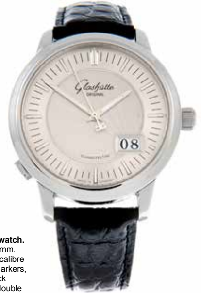
GLASHÜTTE ORIGINAL - a wrist watch. Stainless steel case. Case width 39mm. Numbered 0393. Signed automatic calibre 100. Silvered dial with baton hour markers, date aperture to five. Fitted to a black crocodile strap with stainless steel double folding clasp. £1,600-2,200 (plus 27.6% BP*)