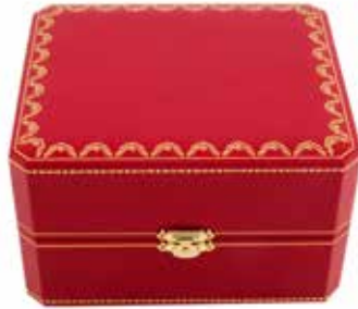
CARTIER - a complete watch box. £50-80 (plus 27.6% BP*)