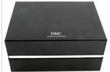
IWC - a complete watch box. £50-80 (plus 27.6% BP*)