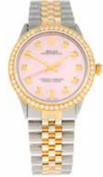
ROLEX - an Oyster Perpetual bracelet watch. Circa 1969. Stainless steel case with diamond set yellow metal bezel. Case width 35mm. Reference not present, serial 2159687. Signed automatic calibre 1520. Pink Mother-of-pearl dial with diamond dot hour markers. Fitted to an unsigned bi-colour bracelet with folding clasp. Please see condition report for details of third party intervention. £3,600-4,600 (plus 27.6% BP*)