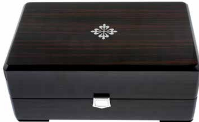
PATEK PHILIPPE - a complete watch box. £100-150 (plus 27.6% BP*)