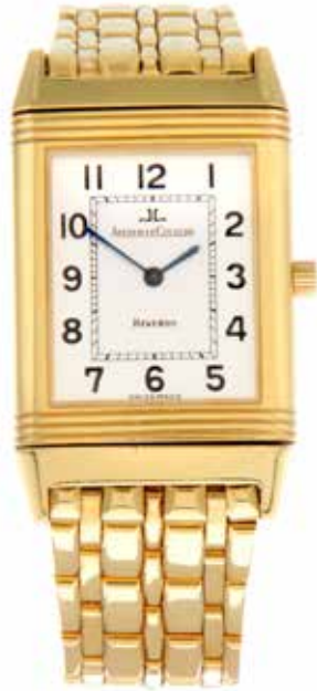
JAEGER-LECOULTRE - a Reverso bracelet watch. 18ct yellow gold case. Case size 22x32mm. Reference 250.1.86, serial 1701554. Manual wind movement. Silvered dial with Arabic numeral hour markers. Fitted to an 18ct yellow gold bracelet with double folding clasp. Pouch, papers and extra links included. £4,000-6,000 (plus 27.6% BP*)