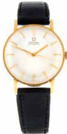
OMEGA - a wrist watch. Yellow metal case stamped 18K 0,750. Case width 32mm. Reference 161 002. Signed automatic calibre 552, numbered 19639040. Silvered dial with baton hour markers. Fitted to an unsigned black leather strap with gold plated pin buckle. £500-700 (plus 27.6% BP*)