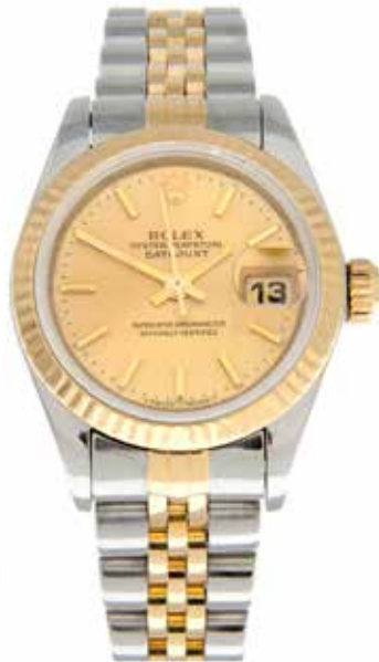
ROLEX - an Oyster Perpetual Datejust bracelet watch. Circa 1995. Stainless steel case with yellow metal fluted bezel. Case width 26mm. Reference 69173, serial W975370. Signed automatic calibre 2135 with quick date set. Champagne dial with baton hour markers, date aperture to three. Fitted to a signed bi-metal Jubilee bracelet with Oysterclasp. £1,600-2,200 (plus 27.6% BP*)