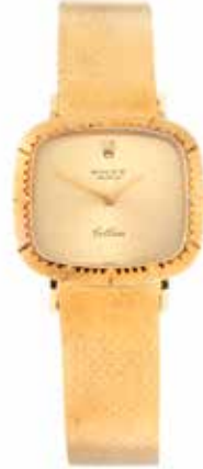
ROLEX - a Cellini bracelet watch. Circa 1976. 18ct yellow gold case. Case width 24mm. Reference 40823, serial 4075497. Signed manual wind calibre 1600. Champagne dial. Fitted to an unsigned 18ct yellow gold bracelet with signed folding clasp. 52gms. £1,700-2,400 (plus 27.6% BP*)