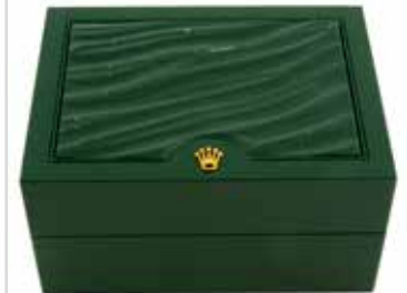
ROLEX - a complete watch box. £60-90 (plus 27.6% BP*)

BP* - Buyer's Premium of 23% (plus VAT) or 27.6% (VAT included)