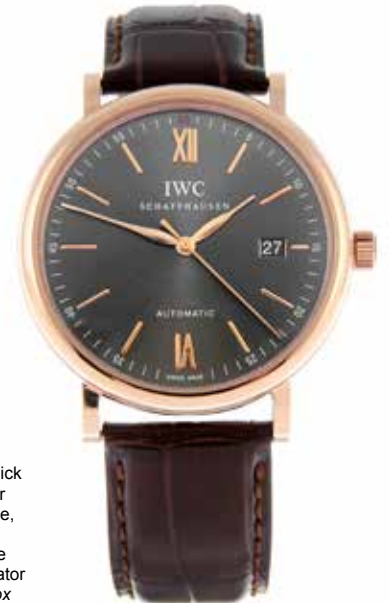
IWC - a Portofino wrist watch. 18ct rose gold case. Case width 40mm. Reference IW356511, serial 5336911. Signed automatic calibre 35111 with quick date set. Slate grey dial with baton hour markers, Roman numeral six and twelve, date aperture to three, outer minute track with Arabic divisions at five minute intervals. Fitted to a signed brown alligator strap with 18ct rose gold pin buckle. Box and papers. £5,000-6,000 (plus 27.6% BP*)