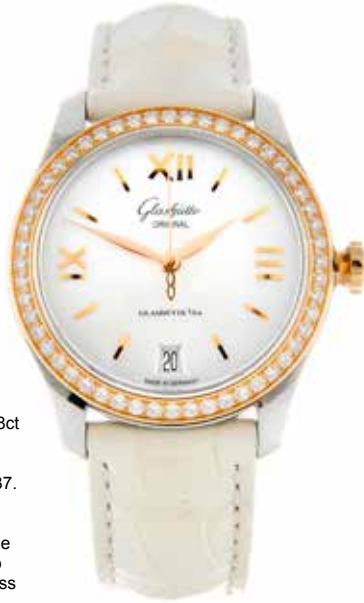
GLASHÜTTE ORIGINAL - a Serenade wrist watch. Stainless steel case with 18ct rose gold factory diamond set bezel and exhibition case back. Case width 36mm. Reference 1-39-22-09-16-04, serial 00737. Signed automatic calibre 39 with quick date set. Mother-of-pearl dial with baton hour markers, Roman numeral three, nine and twelve, date aperture to six. Fitted to a signed white alligator strap with stainless steel deployant clasp. Box and papers. £4,000-6,000 (plus 27.6% BP*)