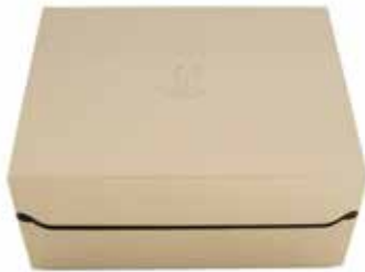
JAEGER-LECOULTRE - a complete watch box. £50-80 (plus 27.6% BP*)