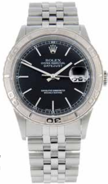
ROLEX - an Oyster Perpetual Datejust 'Turn-O-Graph' bracelet watch. Circa 1997. Stainless steel case with white metal bezel. Case width 36mm. Reference 16264, serial U978555. Signed automatic calibre 3135 with quick date set. Black dial with baton hour markers, date aperture to three. Fitted to a signed stainless steel Jubilee bracelet with Oysterclasp. Box. £3,000-4,000 (plus 27.6% BP*)