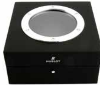
HUBLOT - a complete watch box. £50-80 (plus 27.6% BP*)