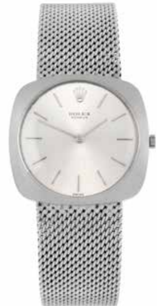
ROLEX - a Cellini bracelet watch. Circa 1965. 18ct white gold case. Case width 30mm. Reference 605, serial 1143861. Signed manual wind calibre 1600. Silvered dial with baton hour markers. Fitted to a signed 18ct white gold integral bracelet with folding clasp. 68gms. £2,000-3,000 (plus 27.6% BP*)