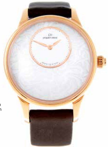
JAQUET DROZ - a limited edition Petite Heure Minute Art Deco wrist watch. Number 3 of 88. 18ct rose gold case with exhibition case back. Case width 39mm. Reference J005013570. Signed automatic calibre 2653.4. White mother-of-pearl "Ramolayée" dial with mother-of-pearl time display dial to twelve. Fitted to a signed brown bi-material strap with 18ct rose gold pin buckle. £6,000-8,000 (plus 27.6% BP*)