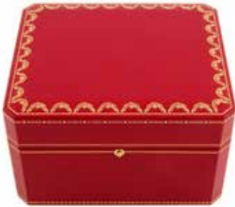
CARTIER - a complete watch box. £50-80 (plus 27.6% BP*)