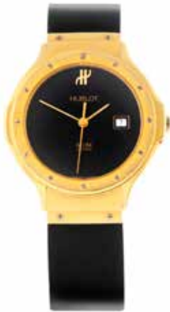
HUBLLOT - an MDM wrist watch. 18ct yellow gold case. Case width 32mm. Reference 1401.3, serial 252444. Signed quartz movement with quick date set. Black dial, date aperture to three. Fitted to a signed black rubber strap with 18ct yellow gold double folding clasp. £1,500-2,000 (plus 27.6% BP*)