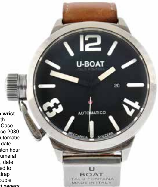
U-BOAT - a Classico wrist watch. Silver case with exhibition case back. Case width 52mm. Reference 2089, serial 0229. Signed automatic movement with quick date set. Black dial with baton hour markers and Arabic numeral four, eight and twelve, date aperture to three. Fitted to a signed tan leather strap with stainless steel double folding clasp. Box and papers. £650-850 (plus 27.6% BP*)