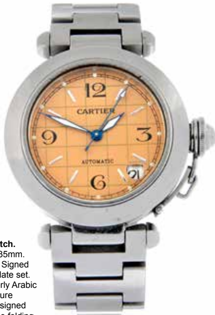
CARTIER - a Pasha bracelet watch. Stainless steel case. Case width 35mm. Reference 2324, serial PB39781. Signed automatic calibre 049 with quick date set. Bronze dial with baton and quarterly Arabic numeral hour markers, date aperture between four and five. Fitted to a signed stainless steel bracelet with double folding clasp. £1,000-1,500 (plus 27.6% BP*)