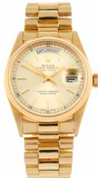
ROLEX - an Oyster Perpetual Day-Date bracelet watch. Circa 1986. 18ct yellow gold case with fluted bezel. Case width 36mm. Reference 18038, serial 9319239. Signed automatic calibre 3055 with quick date set. Champagne dial with baton hour markers, day and date aperture to twelve and three. Fitted to a signed President bracelet with Crownclasp. 135gms. £10,000-15,000 (plus 27.6% BP*)