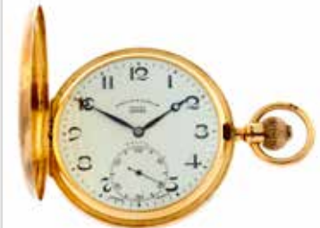
A full hunter pocket watch by Pidduck & Sons Ltd. 18ct yellow gold case, hallmarked London 1927. Case width 50mm. Numbered 2773. Signed keyless wind calibre 1989. White dial with Arabic numeral, subsidiary seconds dial to six. Box. 105gms. £1,400-2,000 (plus 27.6% BP*)

BP* - Buyer's Premium of 23% (plus VAT) or 27.6% (VAT included)