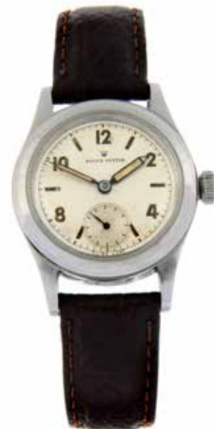
ROLEX - an Oyster wrist watch. Circa 1942. Stainless steel case. Case width 30mm. Reference 3980, serial 192242. Signed manual wind movement. Silvered dial with alternating Arabic numeral and baton hour markers, subsidiary seconds dial to six. Fitted to an unsigned brown leather strap with nickel plated pin buckle. £550-750 (plus 27.6% BP*)

BP* - Buyer's Premium of 23% (plus VAT) or 27.6% (VAT included)