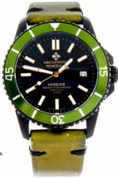
MECCANICHE VENEZIANE - a Nereide wrist watch. Stainless steel PVD-treated case with calibrated bezel and exhibition case back. Case width 41mm. Signed automatic calibre MV285 with quick date set. Black dial with luminous baton hour markers, date aperture to three. Fitted to a signed green leather strap with PVD-treated pin buckle. Box. £300-400 (plus 27.6% BP*)