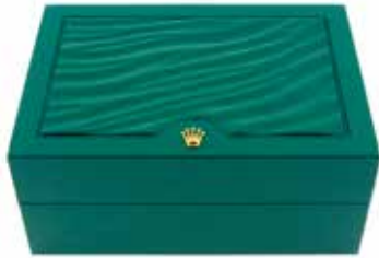
ROLEX - a complete watch box. £100-150 (plus 27.6% BP*)