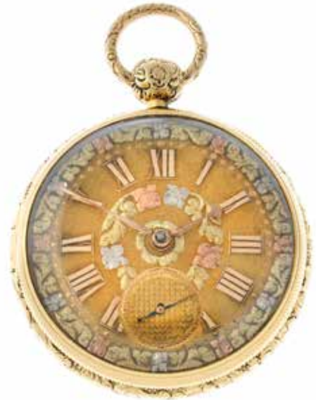
An open face pocket watch by M. I. Tobias & Co. 18ct yellow gold case, hallmarked Chester, year unknown. Numbered 3665. Case width 53mm. Signed key wind fusee and chain movement with ratchet tooth lever escapement. Gilt tri-colour dial with Roman numeral hour markers and decorative inner and outer detailing, subsidiary seconds dial to six. 135gms. £1,800-2,400 (plus 27.6% BP*)