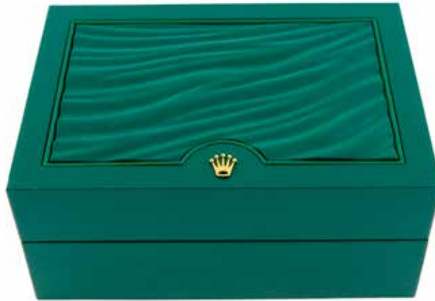
ROLEX - a complete watch box. £100-150 (plus 27.6% BP*)