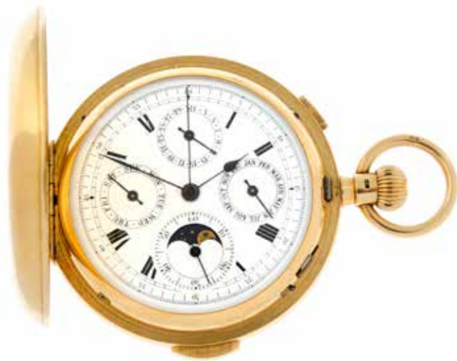
A full hunter triple date repeater pocket watch. 18ct yellow gold case, hallmarked London 1925. Case width 57mm. Unsigned keyless wind movement with club tooth escapement and a repeater complication. White dial with Roman numeral hour markers, subsidiary date dials to three, nine and twelve, seconds and moon phase indicator to six. 169gms. £3,600-4,600 (plus 27.6% BP*)