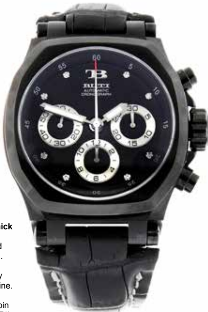
TB BUTI - a limited edition Yanick II chronograph wrist watch. Numbered 102/500. PVD-treated titanium case. Case width 42mm. Automatic movement. Black dial with dot hour markers, subsidiary recorder dials to three, six and nine. Fitted to a signed black leather strap with PVD-treated titanium pin buckle. £450-650 (plus 27.6% BP*)