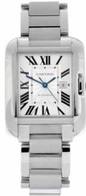
CARTIER - a Tank Anglaise bracelet watch. Stainless steel case. Case width 30mm. Reference 3511, serial 119520TX. Signed automatic calibre 077. Silvered dial with Roman numeral hour markers, date aperture to three. Fitted to a signed stainless steel bracelet with double folding clasp. £1,600-2,400 (plus 27.6% BP*)

BP* - Buyer's Premium of 23% (plus VAT) or 27.6% (VAT included)