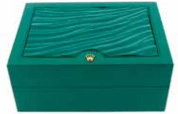
ROLEX - a complete watch box. £100-150 (plus 27.6% BP*)