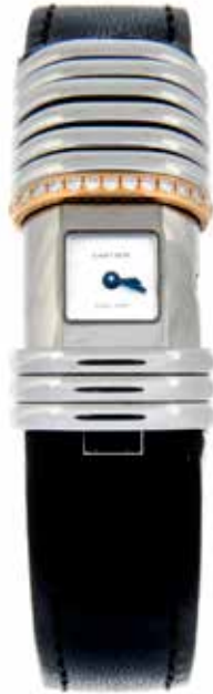
CARTIER - a Declaration wrist watch. Bi-metal factory diamond set case with sliding rings. Case width 15mm. Reference 2611, serial 64120CE. Quartz movement. Silvered dial. Fitted to an unsigned black leather strap with signed stainless steel folding clasp. £1,100-1,600 (plus 27.6% BP*)