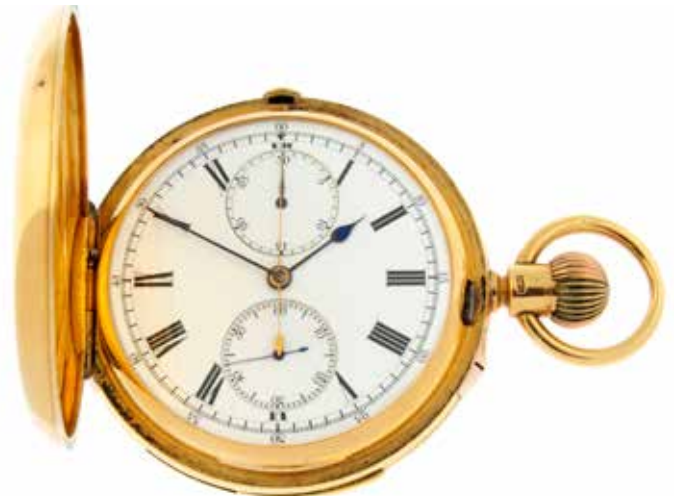
A full hunter chronograph pocket watch. 18ct yellow gold case, hallmarked London 1898. Case width 56mm. Unsigned keyless wind three quarter plate movement with club tooth escapement. White dial with Roman numeral hour markers, subsidiary dials to six and twelve. 198gms. £3,600-4,600 (plus 27.6% BP*)