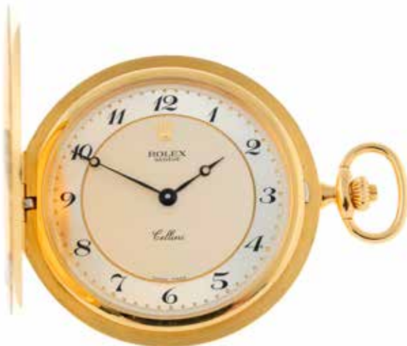
A full hunter Cellini pocket watch by Rolex. 18ct yellow gold case. Case width 47mm. Reference 3759/8, serial D793152. Signed keyless wind calibre 750. Silvered dial with Arabic numeral hour markers. 106gms. Box and papers. £3,600-4,600 (plus 27.6% BP*)