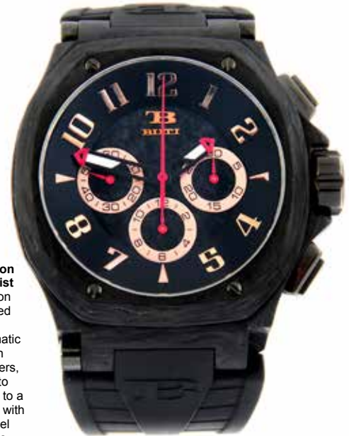
TB BUTI - a limited edition Stealth chronograph wrist watch. Number 92. Carbon fibre case with PVD-treated stainless steel case back. Case width 47mm. Automatic movement. Black dial with Arabic numeral hour makers, subsidiary recorder dials to three, six and nine. Fitted to a signed black rubber strap with PVD-treated stainless steel pin buckle. £450-650 (plus 27.6% BP*)