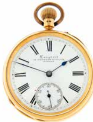
An open face pocket watch retailed by Langford. 18ct yellow gold case, hallmarked London 1891. Case width 49.5mm. Signed key wind full plate going barrel movement with ratchet tooth lever escapement. White dial with Roman numeral hour markers, subsidiary seconds dial to six. 96gms. £900-1,400 (plus 27.6% BP*)