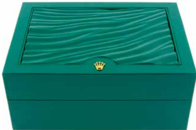
ROLEX - a complete watch box. £100-150 (plus 27.6% BP*)

BP* - Buyer's Premium of 23% (plus VAT) or 27.6% (VAT included)