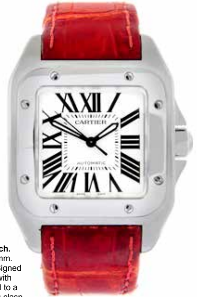
CARTIER - a Santos 100 wrist watch. Stainless steel case. Case width 33mm. Reference 2878, serial 498526RX. Signed automatic calibre 076. Silvered dial with Roman numeral hour markers. Fitted to a red alligator strap with double folding clasp. £2,200-2,800 (plus 27.6% BP*)