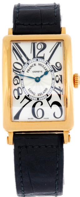
FRANCK MULLER - a Long Island wrist watch. 18ct yellow gold case. Case width 26mm. Reference 950QZ, numbered 88. Unsigned quartz movement. Silvered dial with Arabic numeral hour markers. Fitted to a signed black alligator strap with 18ct yellow gold pin buckle. Box and papers. £2,000-2,500 (plus 30% BP*)