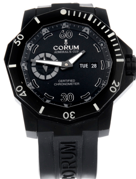
CORUM - a limited edition Admiral's Cup Seafender Deep Hull 48 wrist watch. Numbered 035/355. PVD-treated titanium case with calibrated bezel. Case width 46mm. Reference 947.950.94 / 0371AN22, serial 2266073. Signed automatic movement with quick day and date set. Black dial with nautical pennant hour markers, Arabic numeral thirty and sixty, subsidiary seconds dial to nine, split day and date aperture to three. Fitted to a signed black rubber strap with PVD-treated titanium pin buckle. Box and papers. £800-1,200 (plus 30% BP*)