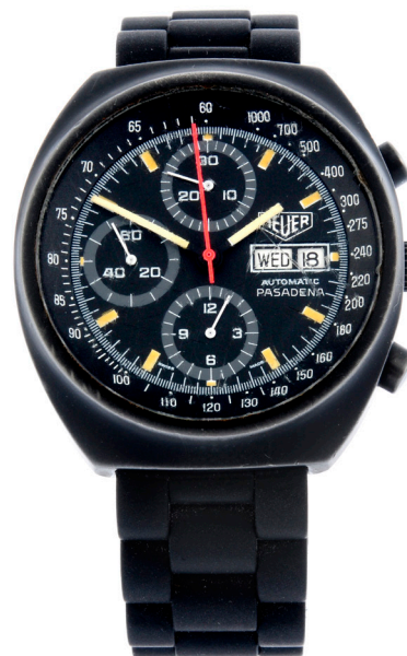
HEUER - a Pasadena chronograph wrist watch. PVD-treated stainless steel case with stainless steel case back. Case width 41mm. Reference 750-501, numbered 280L. Signed automatic movement with quick day and date set. Black dial with baton hour markers, subsidiary recorder dials to six, nine and twelve, day and date aperture to three. Tachymeter rehaut. Fitted to an unsigned black rubber strap with stainless steel deployant clasp. £900-1,400 (plus 30% BP*)