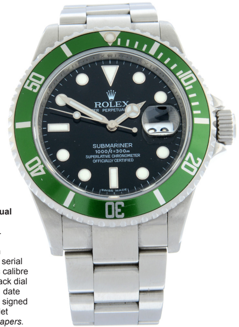
ROLEX - an Oyster Perpetual Date Submariner "Kermit" bracelet watch. Circa 2007. Stainless steel case with calibrated bezel. Case width 40mm. Reference 16610LV, serial M093312. Signed automatic calibre 3135 with quick date set. Black dial with luminous hour markers, date aperture to three. Fitted to a signed stainless steel Oyster bracelet with Oysterclasp. Box and papers. £12,000-18,000 (plus 30% BP*)