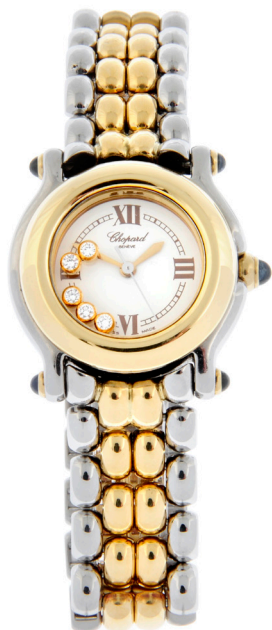
CHOPARD - a Happy Sport bracelet watch. Stainless steel case with yellow metal bezel. Case width 25mm. Unsigned quartz movement. White dial with quarterly Roman numeral hour markers, five factory set free-play diamonds. Fitted to a signed bi-metal bracelet with double folding clasp. £1,000-1,500 (plus 30% BP*)