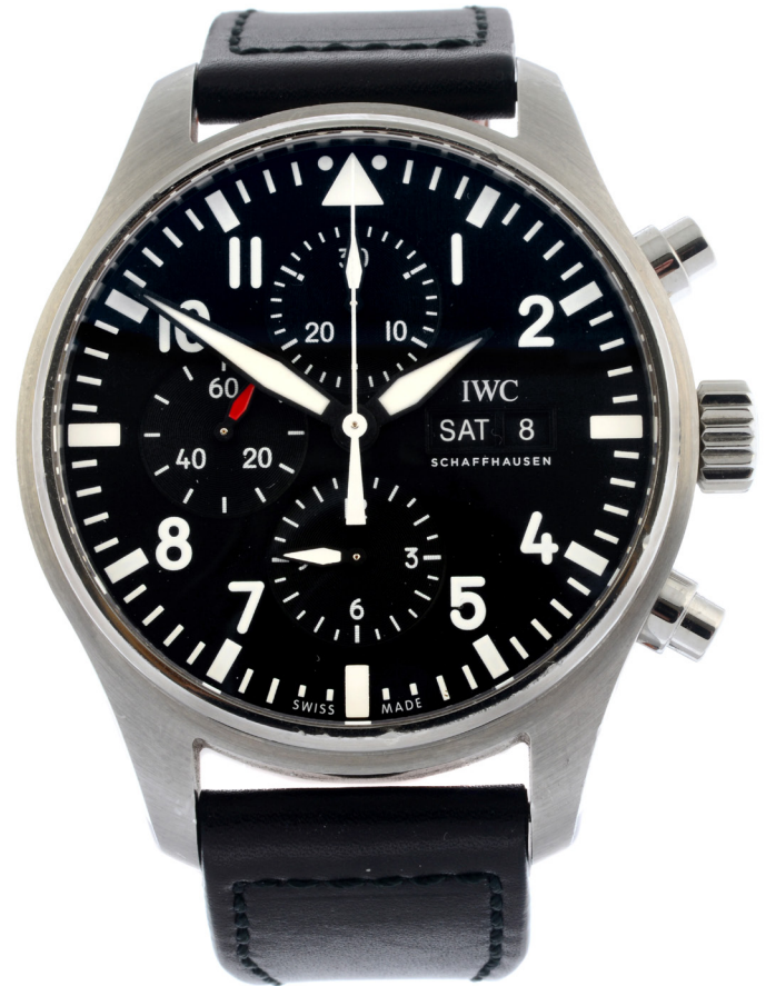
IWC - a Pilot chronograph wrist watch. Stainless steel case. Case width 43mm. Reference 3777, serial 5566088. Signed automatic movement with quick day and date set. Black dial with Arabic numeral hour markers, subsidiary recorder dials to six, nine and twelve, day and date aperture to three. Fitted to a signed black leather strap with stainless steel pin buckle. £2,800-3,200 (plus 30% BP*)

BP* - Buyer's Premium of 25% (plus VAT) or 30% (VAT included)