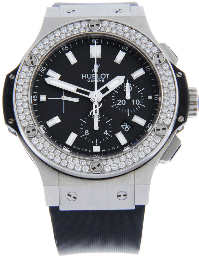
HUBLOT - a Big Bang chronograph wrist watch. Bi-material case with diamond set bezel and exhibition case back. Case width 48mm. Reference 301, serial 804773. Signed automatic calibre 4104 with quick date set. Black dial with baton hour markers, subsidiary recorder dials to three, six and nine, date aperture between four and five. Fitted to a signed black rubber strap with stainless steel deployment clasp. Box. Please see the condition report for details of third party intervention. £5,000-7,000 (plus 30% BP*)