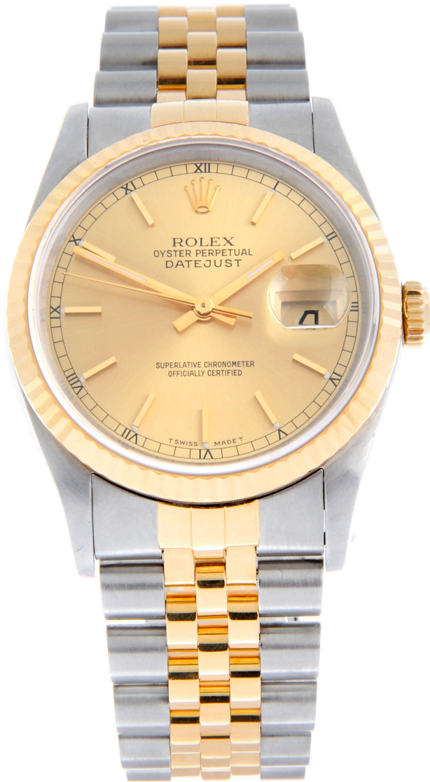
ROLEX - an Oyster Perpetual Datejust bracelet watch. Circa 1991. Stainless steel case with yellow metal fluted bezel. Case width 36mm. Reference 16233, serial X394302. Signed automatic calibre 3135 with quick date set. Champagne dial with baton hour markers, date aperture to three. Fitted to a signed bi-metal Jubilee bracelet with Oysterclasp. £2,500-3,000 (plus 30% BP*)