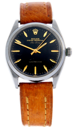
ROLEX - an Oyster Perpetual Air-King wrist watch. Circa 1962. Stainless steel case with engraved case back. Case width 34mm. Reference 5500, serial 772880. Signed automatic calibre 1530. Black dial with lozenge hour markers. Fitted to a signed tan leather strap with gold plated pin buckle. Box and papers. £1,600-2,400 (plus 30% BP*)

BP* - Buyer's Premium of 25% (plus VAT) or 30% (VAT included)