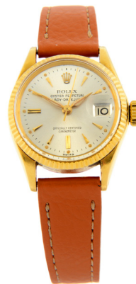
ROLEX - an Oyster Perpetual Lady-Datejust wrist watch. Circa 1963. 18ct yellow gold case with fluted bezel. Case width 25mm. Reference 6517, serial 936343. Signed automatic calibre 1130. Silvered dial with arrowhead hour markers and baton hour marker six and nine, date aperture to three. Fitted to an unsigned tan leather strap with signed gold plated pin buckle. £2,500-3,000 (plus 30% BP*)